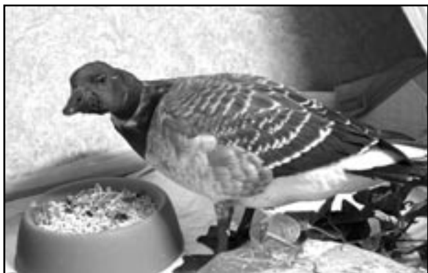
(above) We're thrilled to see this Brant goose take to the skies (or water) once more! It was a charming patient.

The Brant goose, with its compact size and striking black-and-white plumage, is a remarkable bird. Adapted to drink saltwater, these geese embark on long migratory journeys from their Arctic breeding grounds to coastal winter