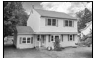
SOLD 10/8 107 Mountain Parkway, Green Brook Listed by Roseann