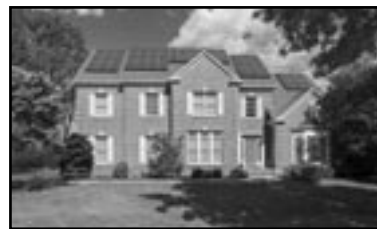
SOLD 3/8 5 Hearthstone Lane, Green Brook Listed by Roseann