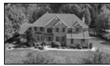
SOLD 1/19 13 Spruce Hollow Rd, Green Brook Listed by Roseann