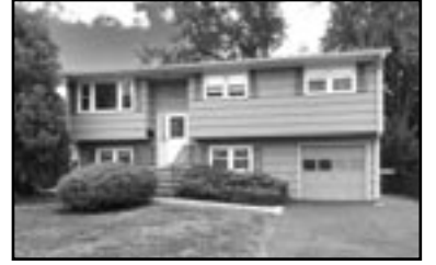
SOLD 12/6 21 Lenox Ave, Green Brook Listed by Roseann