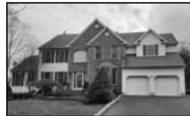
SOLD 6/25 3 Spruce Hollow Rd, Green Brook Listed by Roseann