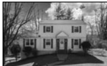
SOLD 6/4 4 Remrose Ledge, Green Brook Listed by Roseann