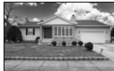
SOLD 3/26 13 Park Ave, Green Brook Listed by Roseann