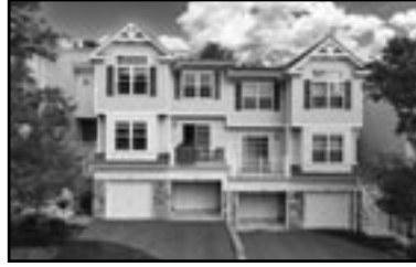
UNDER CONTRACT 1092 Shadowlawn Drive, Green Brook Listed by Roseann