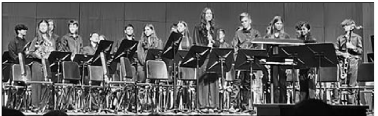
(above) The Winter Instrumental Concert featured the incredible talent and teamwork of Watchung Hills Regional High School students while fostering a sense of togetherness and holiday cheer.