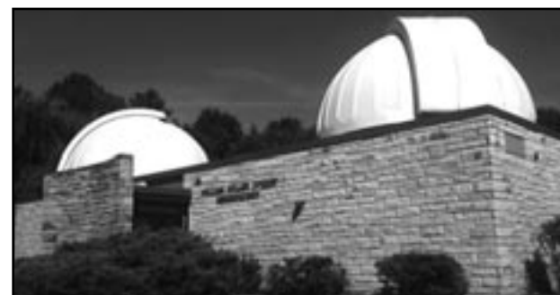
(above) AAI has always interested anyone who loves learning about the night sky. Housed in the William Miller Sperry Observatory on the Union College campus in Cranford, the observatory is open to the public every Friday nights. One of the domes houses a 24-inch reflector and the other dome houses a refractor. Public lectures start at 8:30 p.m. on Fridays, on current topics in Astronomy.

Amateur Astronomers, Inc. along with the North Jersey Astronomical Group, two amateur astronomy clubs located in New Jersey, are once again holding their annual Astronomy Day on Saturday, May 17, 2025. The event will be held in 2 locations: Trailside Nature & Science Center in Mountainside in the afternoon and at William Miller Sperry Observatory on the campus of Union College in Cranford in the evening. The theme is "Solar Max, Unlocking the Secrets of the Sun." This is a family friendly event that focuses on learning about our Sun and its impact on us, and also about astronomy and related sciences in a fun and easy to understand atmosphere. This event appeals to both children and adults. The event is free and open to the public and does not require preregistration. So, mark your calendars for Saturday, May 17, 2025, and come out to learn more about the Sun and our universe!