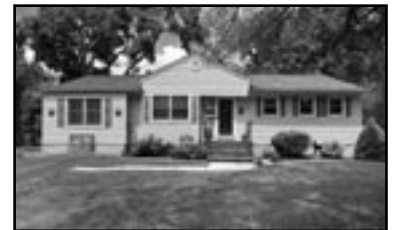
SOLD 6/14 10 Blue Hills Terrace, Green Brook Listed by Roseann