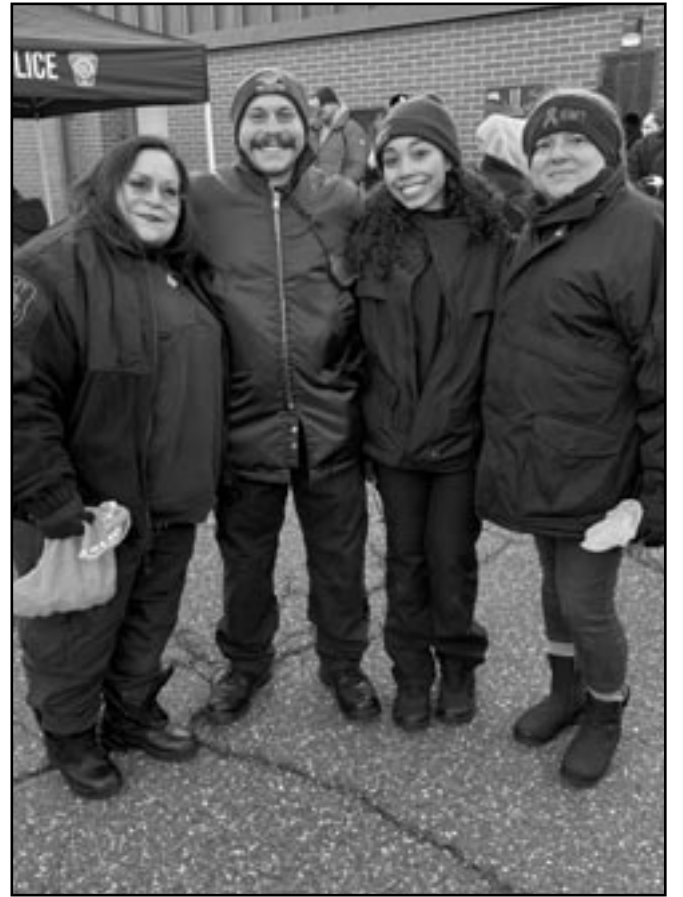
Photos from this and other events can be found online at rennamedia.com and on Garwood Times page on facebook.com . Feel free to "Like," "Tag," and "Share."