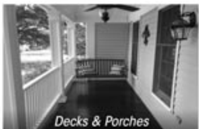
Decks & Porches