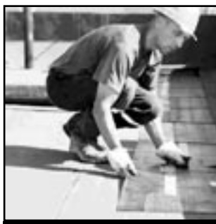
FLAT TOP ROOF