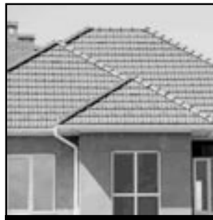
SPANISH STYLE ROOF