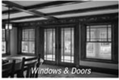
Windows & Doors