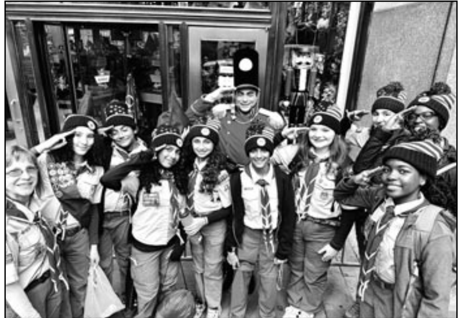
(above) Scouting America Troop 19 salutes FAO Schwarz at Rockefeller Center

This year marked the Troop's fifth consecutive appearance in the parade, a tradition they have embraced since 2019. Once again, they were invited by the USS Intrepid Former Crew