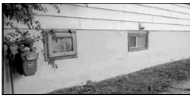
FOUNDATION REPAIRS BEFORE & AFTER