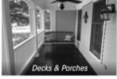
Decks & Porches