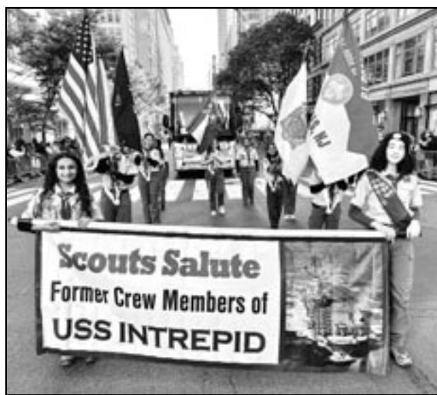
(above) Scouting America Troop 19 marking up 5th Avenue with the Former Members of the USS Intrepid

The Troop returned home to New Jersey by 5 p.m., enriched by their experience and proud of their role in honoring America's veterans. For Troop 19, the Veterans Day Parade was not just an event but a heartfelt tradition, an opportunity to honor the sacrifices of those who served and to demonstrate their unwavering commitment to service and citizenship.