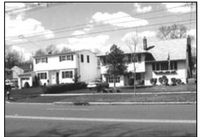
(above) Two styles of home designs.