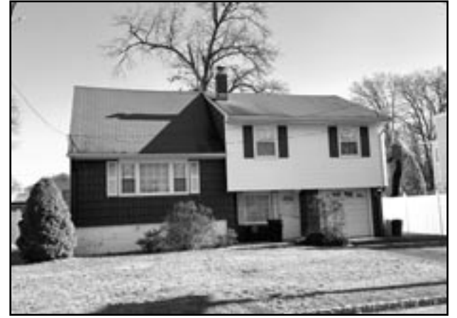
(above) Model home at 1 Epping Dr. bought for $20,490 in 1959; sold for $549,000 2024.