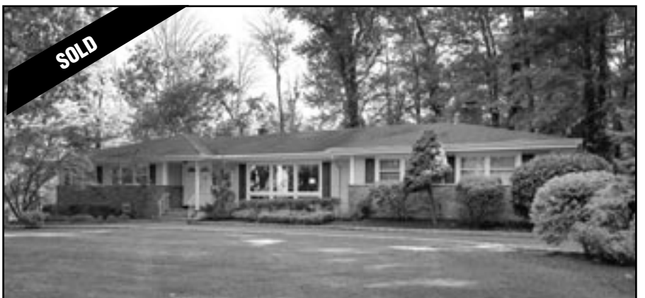
1 Heather Lane, Scotch Plains 3 Bedrooms | 2.1 Baths | $999,999