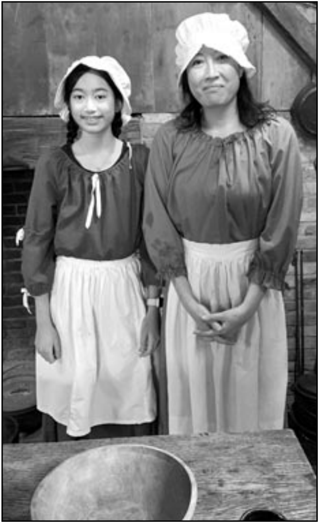
(above) If you haven't visited the Miller-Cory House Museum now is a great time. The house is open for a two-day event on October 19 and 20 for Four Centuries in a Weekend.