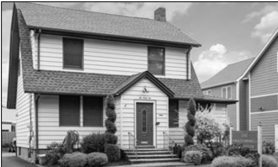
242 St. Paul Street, Westfield Commercial or Residential | $699,900