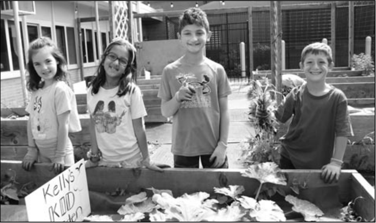
(above) School gardens, like this one at Jefferson Elementary School, are among the many considerations that led to all Westfield Public Schools receiving Bronze level certification.

In March, Westfield High School received a $10,000 grant from Sustainable Jersey for Schools to install a “Student Bike Oasis,” a weather-protected shelter to promote bicycle safety and eco-friendly commuting to and from the high school.