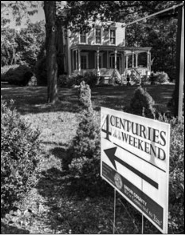
(above) Visitors are encouraged to stop by the Reeve House, in Westfield, during Union County’s Four Centuries in a Weekend on Oct. 19-20.

For more information on the Westfield Historical Society and their events, visit www.westfieldhistoricalsociety.org and on Facebook and Instagram.