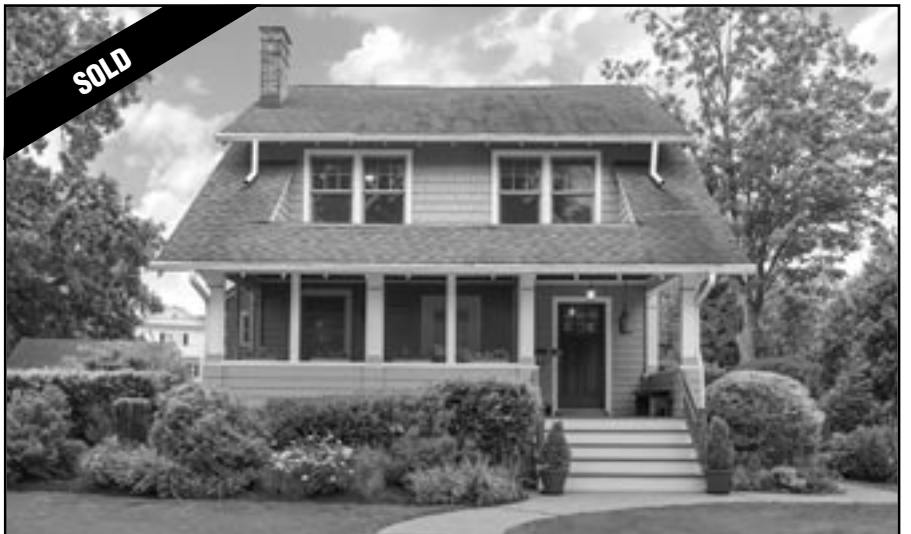
615 Dorian Road, Westfield 4 Bedrooms | 3.1 Baths | $1,095,000