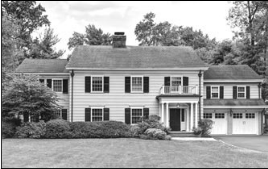
585 Highland Avenue, Westfield 6 Bedrooms | 5.1 Baths | $2,585,000