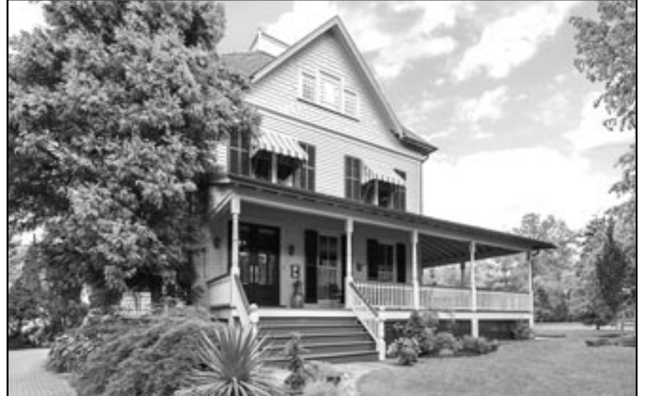
427 Boulevard, Westfield Multi-Family Home | $1,095,000