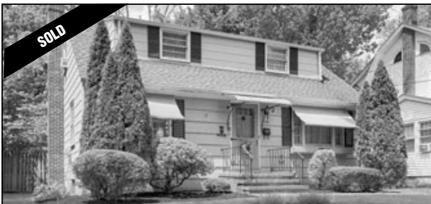
113 Pearl Street, Westfield 3 Bedrooms | 2 Baths | $675,000