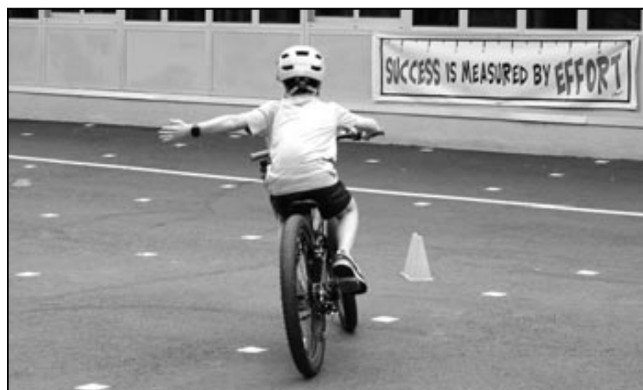
(above) Washington 5th graders learned important bike safety tips during a "Bike Rodeo" in June.