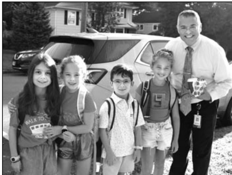
(above) The Walk and Bike to School event in October is an annual favorite at Westfield elementary schools.

"The recognition of our district for its efforts in sustainability and safe and healthy fitness initiatives closely aligns with our 5-year Strategic