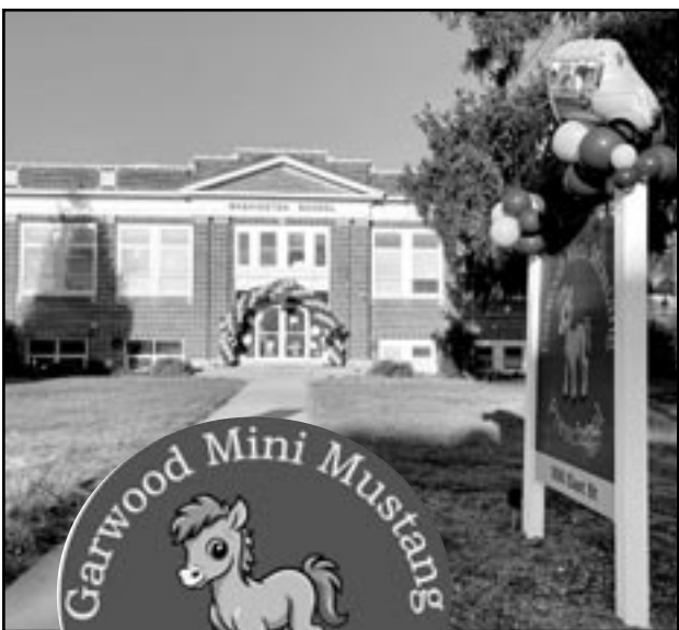
(above) Mini Mustang Preschool Opens Up at Washington School

The Mini Mustang Preschool program will be a staple of the early education foundation necessary for the youngest learners in Garwood for years to come.