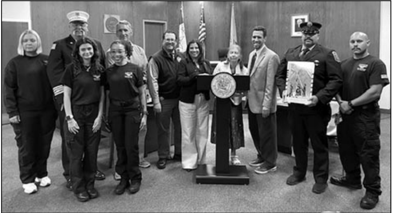
(above) At a remembrance ceremony for 9/11, the Garwood Partnership for Arts and Culture presented a framed 9/11 photograph to the Garwood Fire Department to honor first responders.