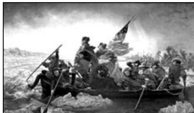
(above) Emanuel Leutze's c. 1850 painting of Washington Crossing the Delaware to be the subject of an in-person lecture on September 17th.