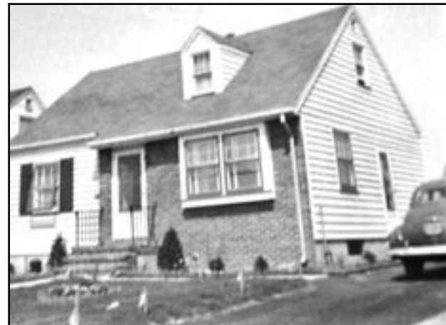
(above) (above) The Kyta home, 42 S. 19th St., ca.1950. Twin of model home.