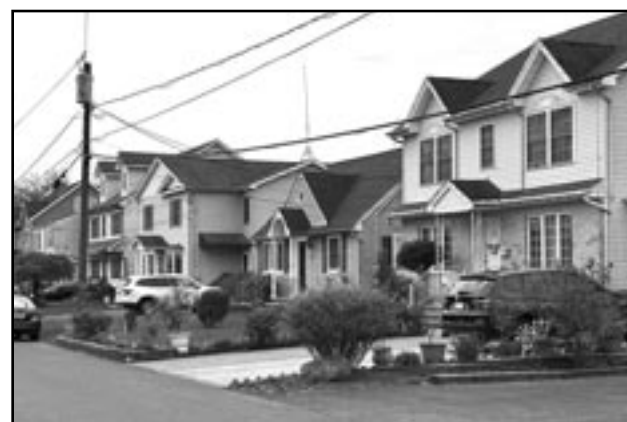
(above) S. 19th St., 2024; model home at right.