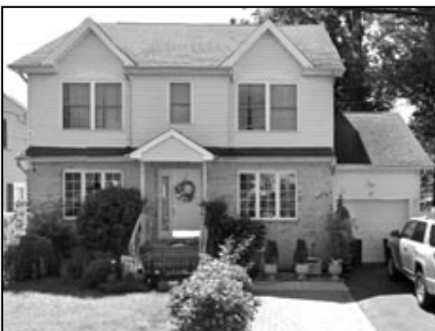
(above) 1949 Model Home 11 S. 19th St. in 2024.