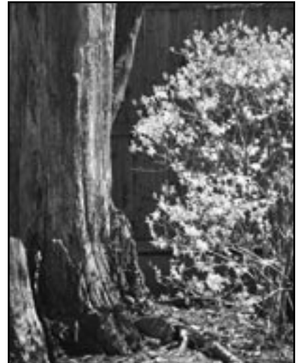
(above) The Gallery-on-the Boulevard, located in the Kenilworth Public Library, presents “Seasons” an exhibit of photographs by photographer Barbara Wirkus of Kenilworth, from September through December.