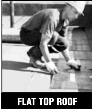
FLAT TOP ROOF