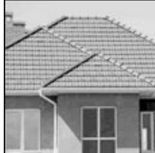
SPANISH STYLE ROOF