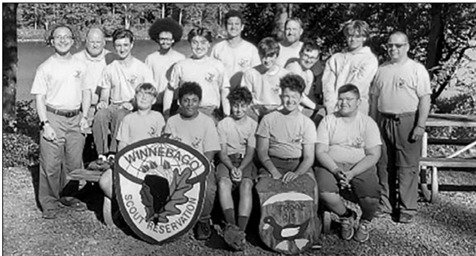
(above) Scouts and leaders of Troop 23 posed for a troop photo during their annual week-long summer camp in July at Winnebago Scout Reservation.