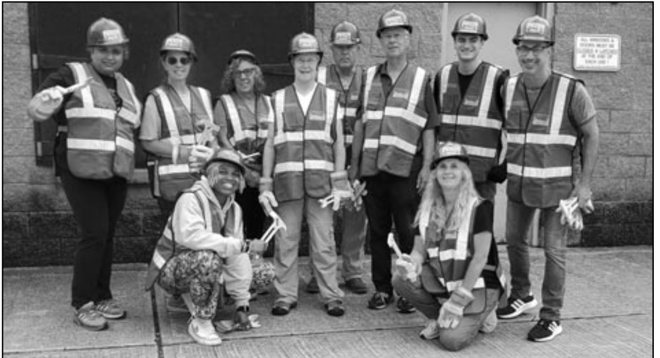
(above) Somerset County's 2024 Community Emergency Response Team (CERT) Basic Training Graduates

For more information regarding the CERT program, please utilize the following link: co.somerset.nj.us/government/public-health-safety/emergency-management/cert-volunteers