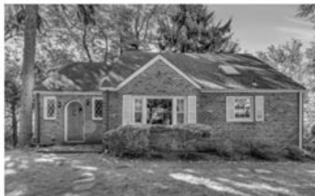
29 Ridge Rd, Chatham, NJ 2 Beds | 1 Bath | 1 Half Bath | $679,000