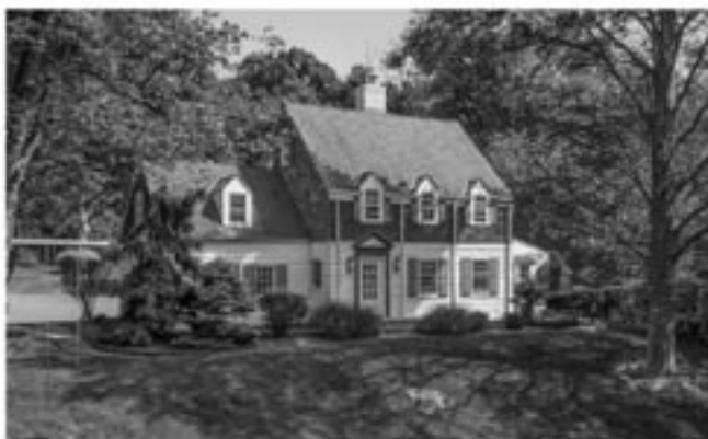
189 Mountain Blvd, Watchung, NJ 3 Beds | 2 Baths | 1 Half Bath | $849,000