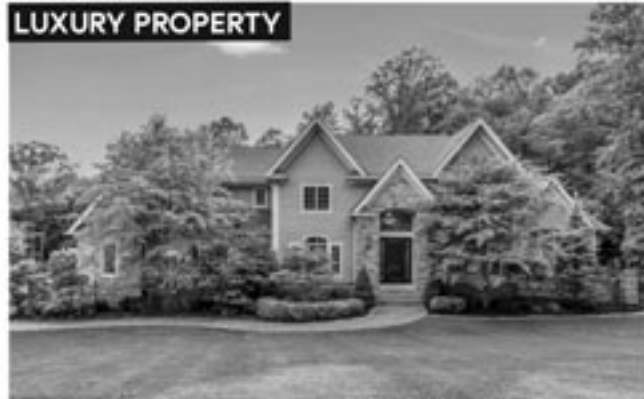
76 Blazier Rd, Martinsville, NJ 6 Beds | 5 Baths | 1 Half Bath | $1,750,000