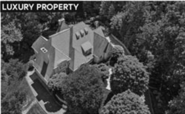
25 Knightsbridge, Watchung, NJ 5 Beds | 6 Baths | 2 Half Baths | $2,895,000