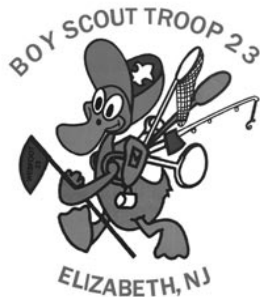
(above) Boy Scout Troop 23 and Cub Scout Pack 23 are looking for uniform parts that can be put back into use by new Scouts.