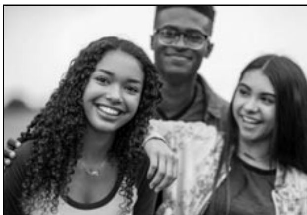
(above) The Gateway Family YMCA's 7th Grade Initiative Begins Registration on August 15th. 7th Grade Students Receive Support Through Membership and Programs.

All 7th Grade students are provided a complimentary full YMCA membership including wellness and fitness access, group exercise programs, basketball, pickleball, soccer, swimming, virtual YMCA360 and a variety of other programs specifically created based on their interests and feedback. The goal of the 7th Grade Initiative is to increase physical activity and support teens in the development of lifetime healthy habits, volunteerism and leadership skills