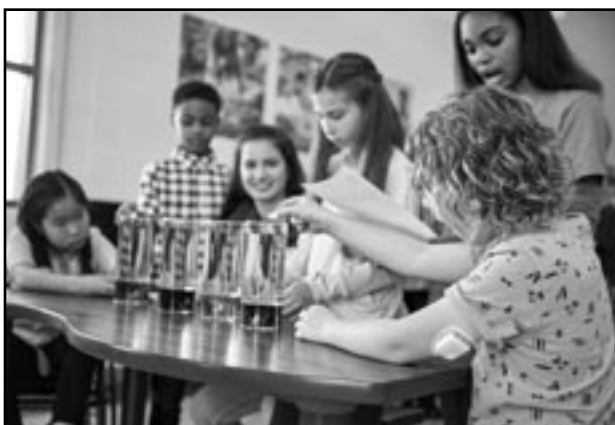
(above) The Gateway Family YMCA's offer safety, enrichment and fun in after school programs.

For more information about The Gateway Family YMCA's school age child care programs, visit tgfymca.org or contact the Elizabeth Branch 908-355-9622, Five Points Branch 908-688-9622 or Rahway Branch 732-388-0057.