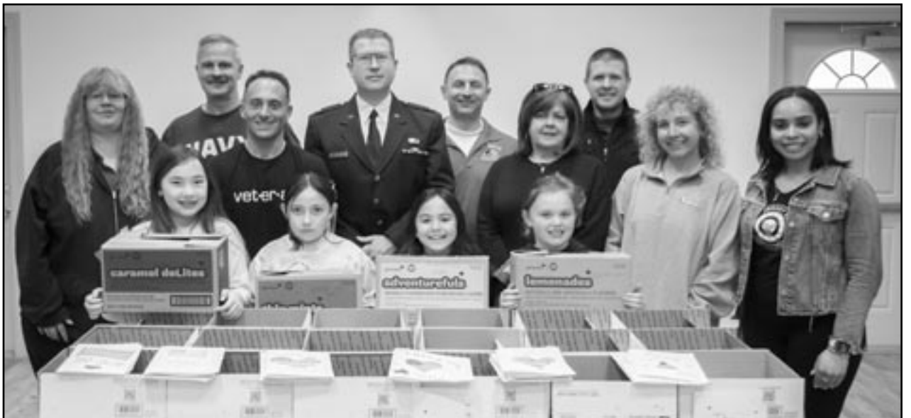
(above) Area Elks recently teamed up with local girl scouts to send care packages to NJ Troops that are stationed overseas.

Elks pledge "So long as there are Veterans, the Benevolent and Protective Order of Elks will never forget them." The same holds true for active duty military members and their families. Please visit Elks.org for more information about the Elks and how to join.