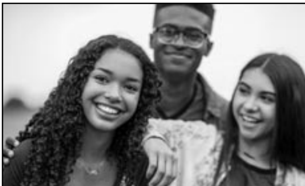
(above) The Gateway Family YMCA's 7th Grade Initiative Begins Registration on August 15th. 7th Grade Students Receive Support Through Membership and Programs.

For more information about The Gateway Family YMCA's school age child care programs, visit tgfymca.org or contact the Elizabeth Branch 908-355-9622, Five Points Branch 908-688-9622 or Rahway Branch 732-388-0057.