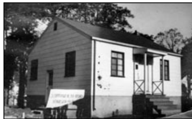
(above) An original home at 3 Commonwealth Rd.