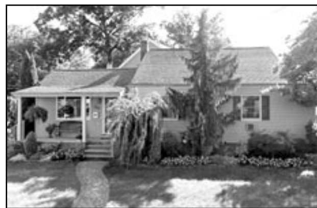
(above) Model home (expanded), 128 Park Dr.

There were development problems leading to the nickname "Mudville." The area was low lying and drainage was poor. Improved roads were lagging behind. Streets became seas of mud with residents forced to park cars blocks away outside of the development. The garbage trucks couldn't get access causing neighbors to pile garbage in their backyards. The sanitary sewer system was not functioning well due to silt build up. Residents signed petitions and attended council meetings demanding action. The town sent in its own road grader to open up roads, but it got stuck in the mud. The town hauled in its own fill dirt to fill in stagnant ponds of water and constructed a drainage ditch along its border with Cranford. Needless to say, this did not please Cranford residents who received the runoff. The Board of Health pressure and the Borough's threat of legal action eventually got the builder to