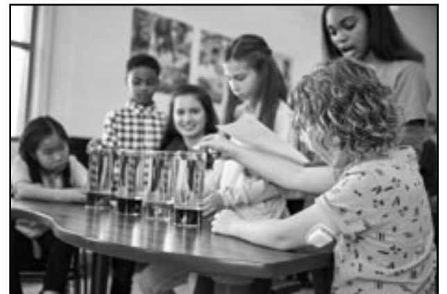
(above) The Gateway Family YMCA's offer safety, enrichment and fun in after school programs.