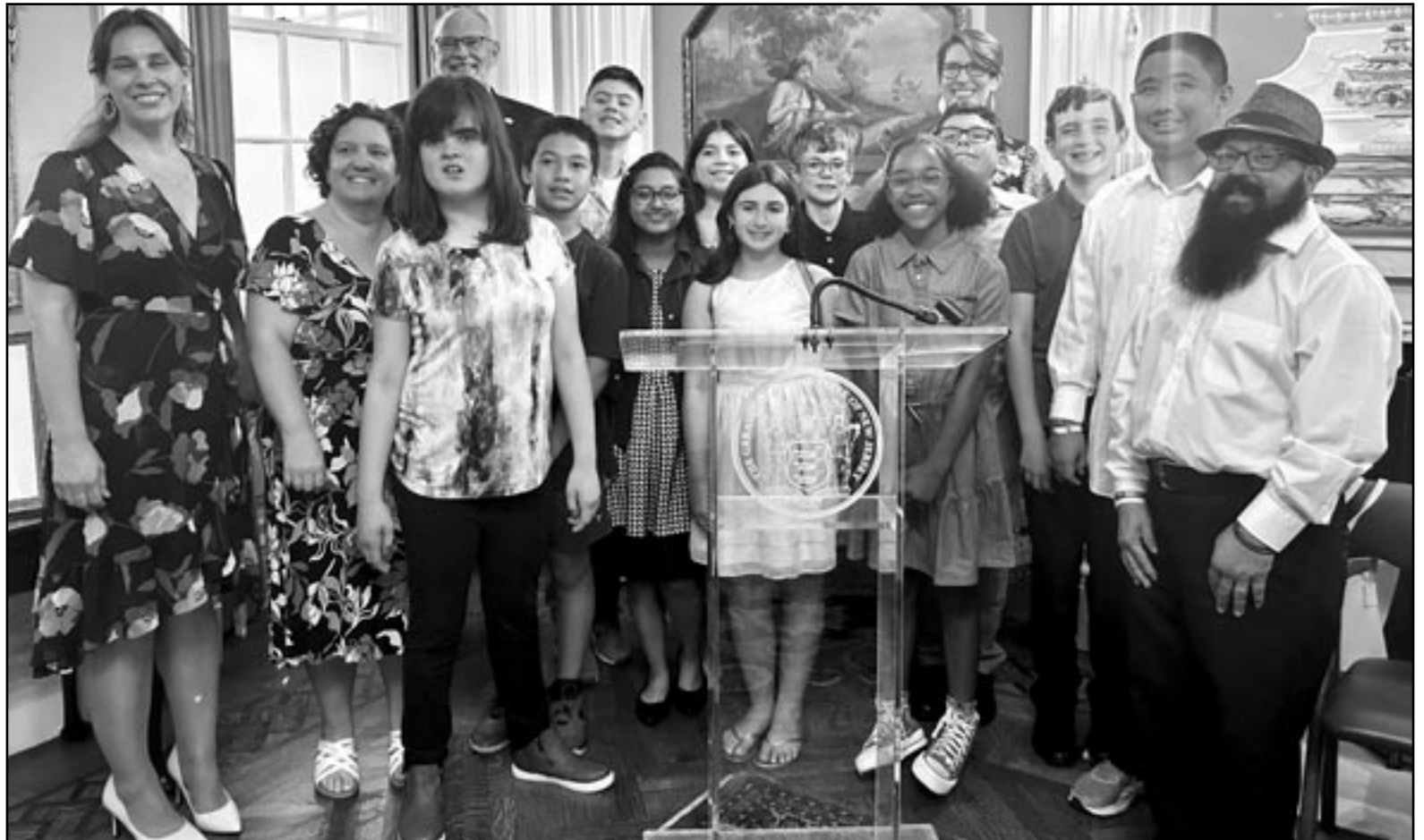
(above) The Green Team was honored at a ceremony held at the Governor's Mansion sponsored by the Drumthwacket Foundation for their impactful work on sustainability.

929 N Washington Ave Green Brook, NJ 08812