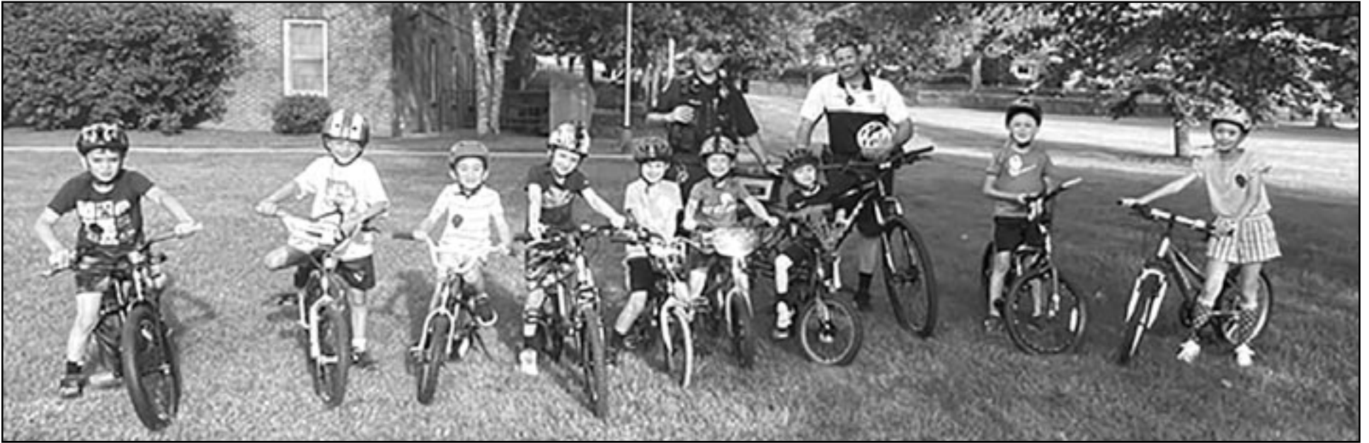
(above) The Florham Park Police Department helped Florham Park Pack 2 Tiger Den achieve their Rolling Tigers Badge in May. The scouts were taught basic bike and helmet safety and how to properly and safely cross a main road.