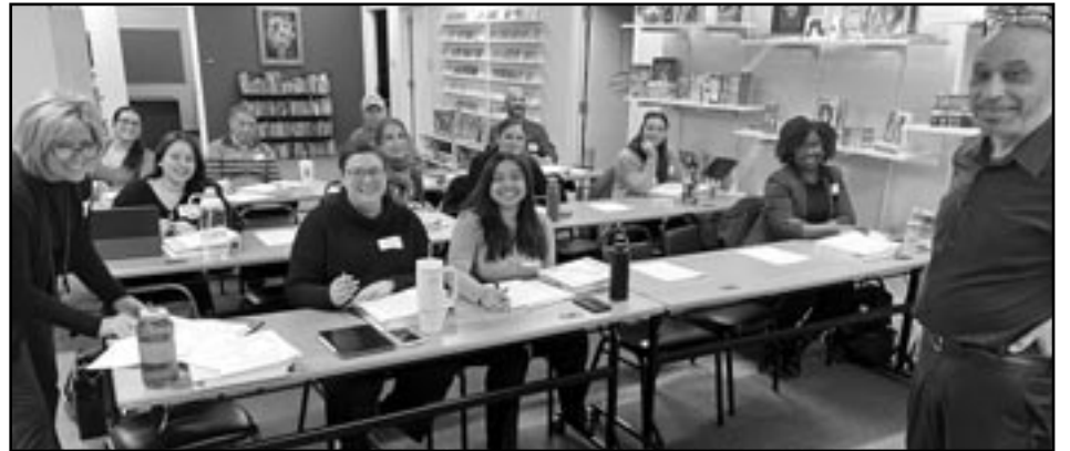
(above) A recent CASA Volunteer class during their training session at the Child Focus office. Courtesy photo

"Our CASA training program is designed to ensure that volunteers have the tools they need to succeed in this role and advocate for what's truly in the best interests of the child or sibling group,"