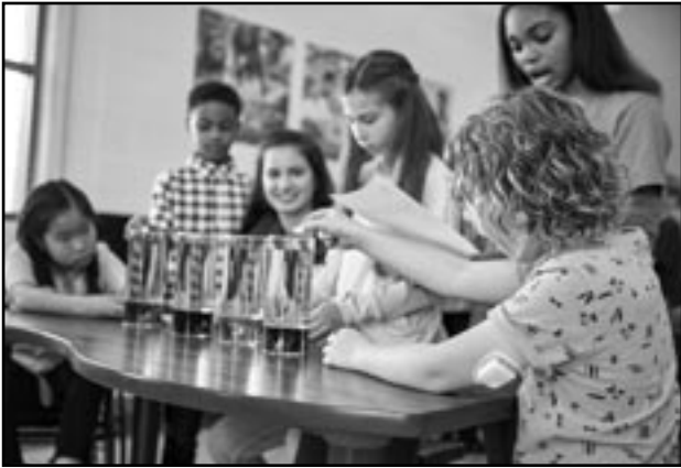
(above) The Gateway Family YMCA's offer safety, enrichment and fun in after school programs.

The Gateway Family YMCA Offers School Age Child Care Programs in Local School Districts. At the Y's Before and After School Programs, kids have a safe place to explore their interests and discover their passions, learn to work and play together and turn classmates into friends. With programs run by caring adult role models who are invested in helping every kid reach their full potential, The Gateway Family YMCA Before and After School Care Programs are a safe place for working families.