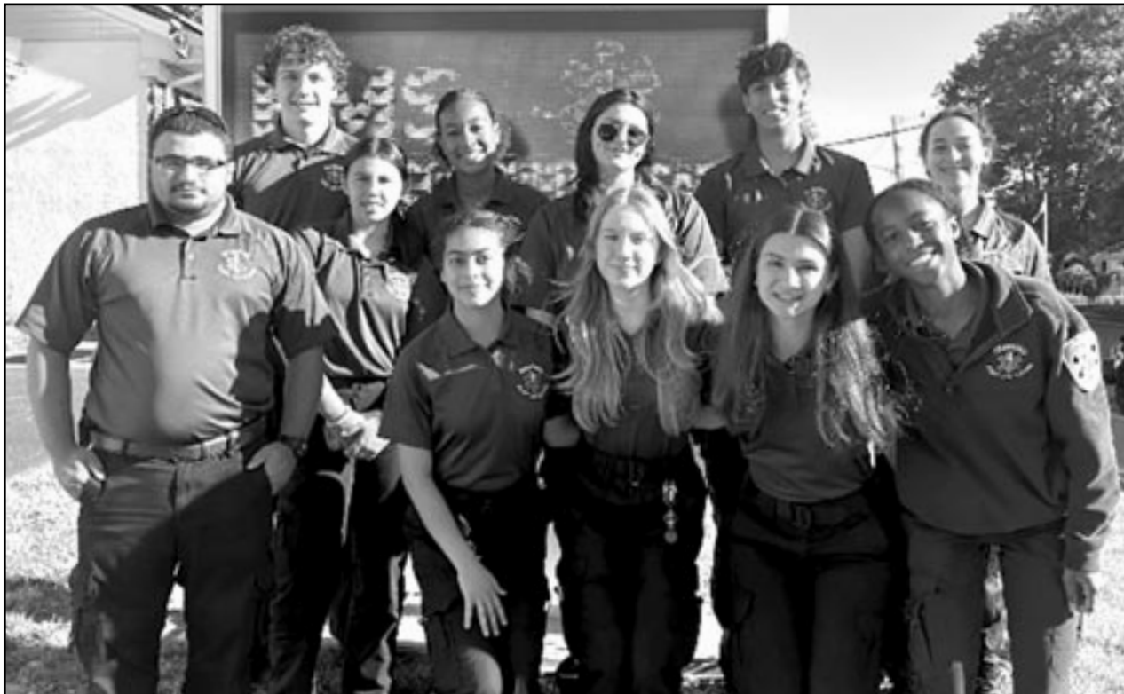
(above) Eleven Cranford Aid Squad cadets competed in the New Jersey State Cadet competition at the Bayshore First Aid Squad in June.

The Cranford First Aid Squad cadet program consists of high school members aged 16-18 with an interest in the healthcare field or further serving their community. The members respond to medical emergencies on the ambulance and have the ability to obtain an EMT certification. Cranford has one of the largest cadet programs in Union County with over 15 members. For more information visit: cranfordfirstaid.org