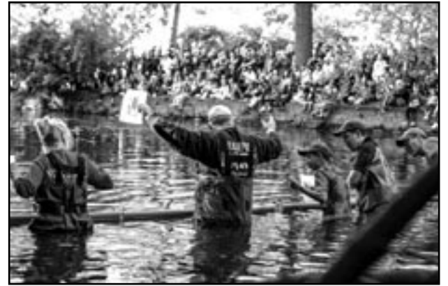
(above) At the finish line, watching for the winning duck!

All proceeds benefit Hanson Park maintenance and educational programs. If you have not yet walked through this lovely little park, please visit this hidden gem located at 38 Springfield Ave. Have you got your Ducky?