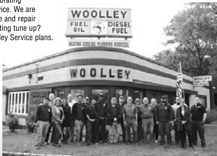
N. Woolley Master HVACR contractor Lic. # 1261

CALL TODAY FOR ALL YOUR AIR CONDITIONING, HEATING, AND FUEL NEEDS 908-760-0583 woolleyfuel.com