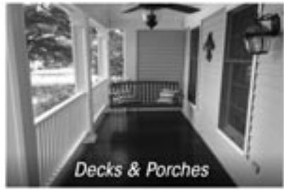
Decks & Porches