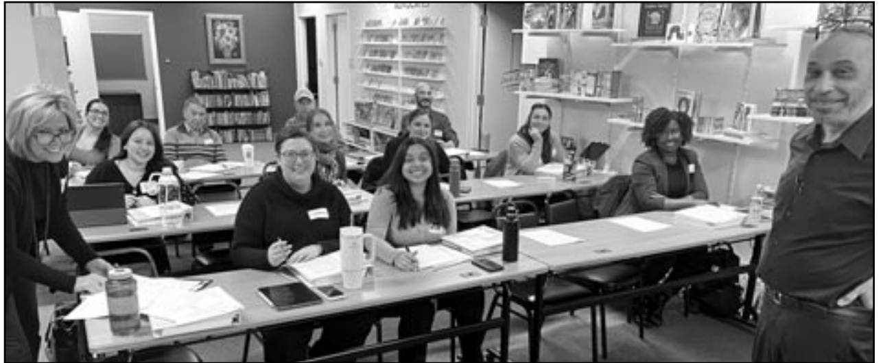
(above) A recent CASA Volunteer class during their training session at the Child Focus office.

Child Focus prioritizes the needs and well-being of infants, children and teens impacted by, or at risk of, abuse or neglect by amplifying their voices and working toward lasting, permanent solutions that address their unique situations and provide support needed to thrive. This critical work is accomplished through three distinct but complementary programs: CASA of Passaic and Union Counties, NJ Safe Babies Court Team, and the Open Door Store. For more information about Child Focus, log on to childfocusnj.org .