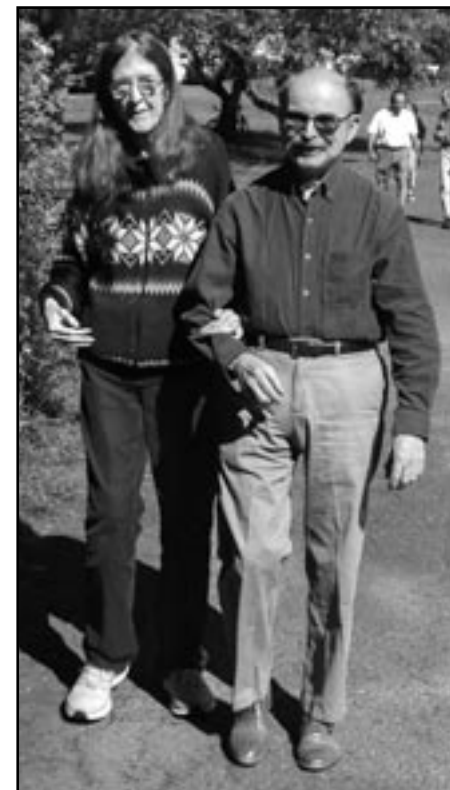
(above) Couple #1 takes the first stroll on Memorial Park Trail.