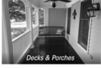
Decks & Porches