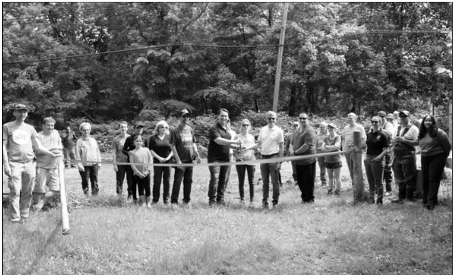
(above) Community members gathered to celebrate New Jersey's first Bandalong Bandit Litter Trap installation.