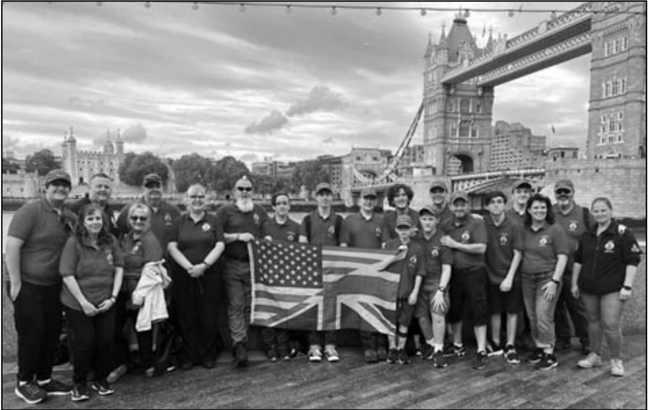
(above) Green Brook Boy Scout Troop 129 will be hosting 18 guests from the United Kingdom this summer. There has been an exchange of scouts and cadets for over 30 years.