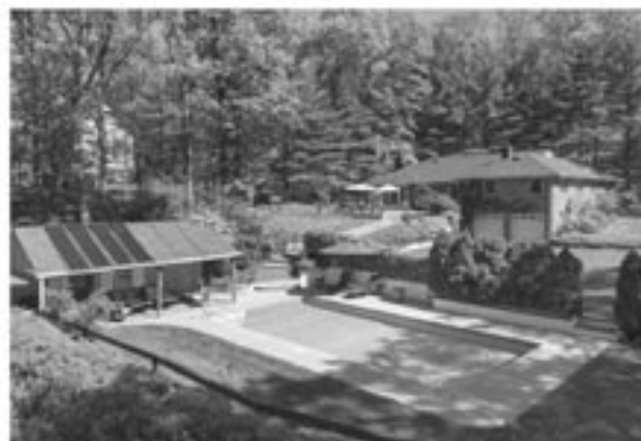
7 Forest Dr, Warren, NJ 3 Beds | 2.5 Baths | $942,000