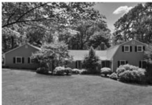
80 Carrar Dr, Watchung, NJ 5 Beds | 4.5 Baths | $1,135,000