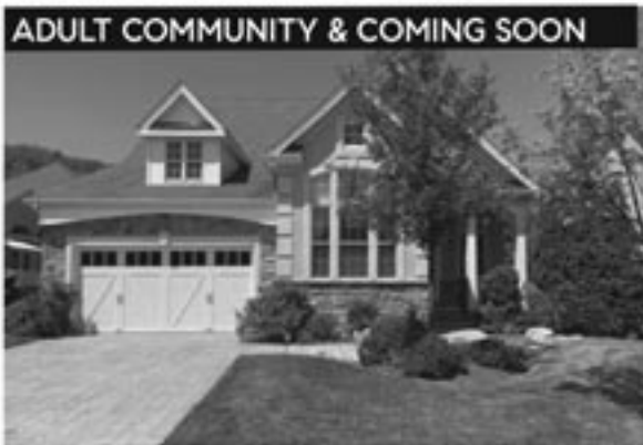
68 Betsy Ross Dr, Warren, NJ 2 Beds | 3 Baths | $1,195,000