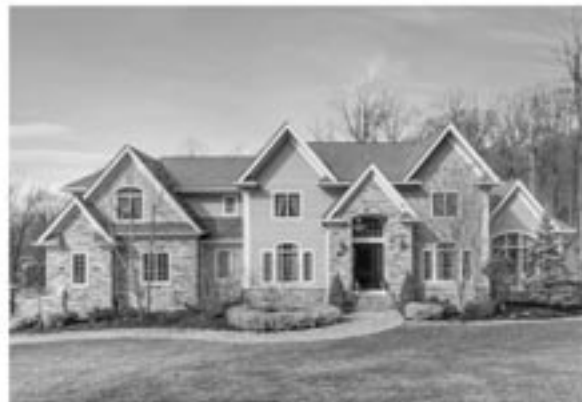
76 Blazier Rd, Bridgewater, NJ 6 Beds | 5.5 Baths | $1,875,000