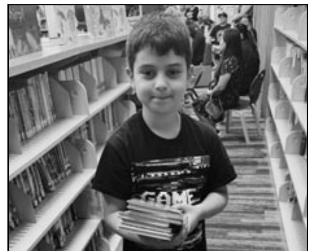
(above) The library was thrilled to host the Roselle Park preschool students and their families for a special storytime and to view their stunning artwork exhibited in our library.