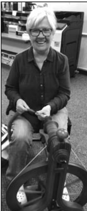
(above) Dee from Union