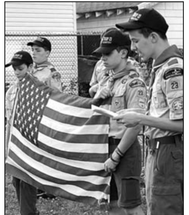
(above) Boy Scouts of Troop 23 will conduct their annual American flag retirement ceremony on Flag Day, Friday, June 14. Members of the public are invited to participate.

Prior to June 14, old flags can be left in the container next to Webby's Woodshed, located behind St. Genevieve's Rectory, near the garages that face Livingston Road.