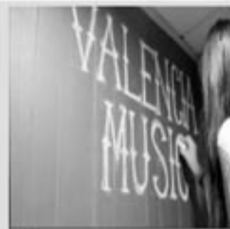
Valencia School of Music