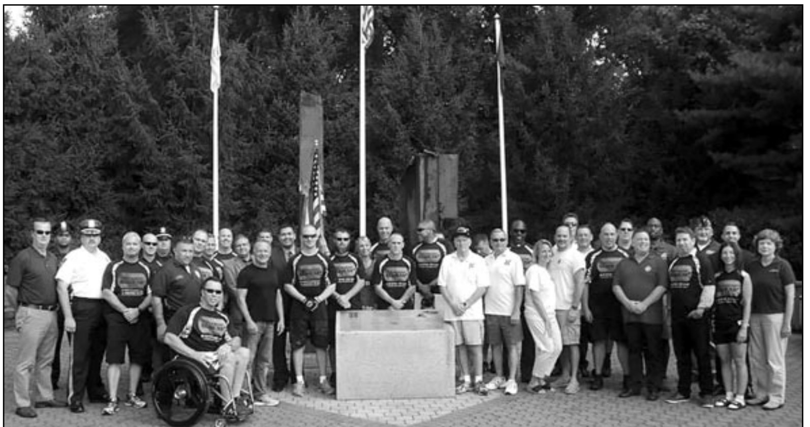
(above) New Jersey Veterans Network veterans and volunteers at a recent event.