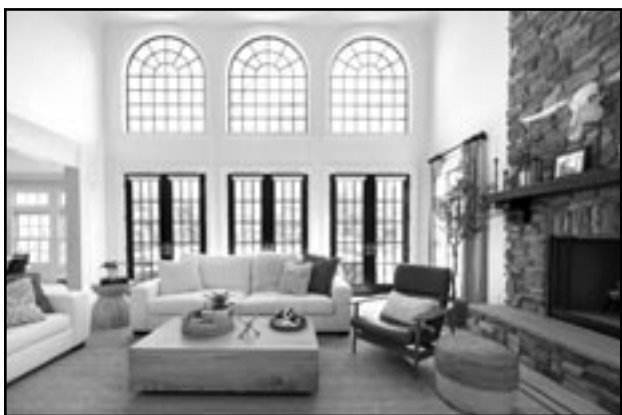
(above) The interior of a home featured in the 2023 HOME Tour. Tour includes a wide variety of architectural and interior design styles.

Limited VIP tickets available for the Preview Party which includes cocktails at a bonus 6th house. Act fast - last year this event sold out! Tickets go on sale May 5. Visit thewarehousenj.org for more information and to purchase tickets.