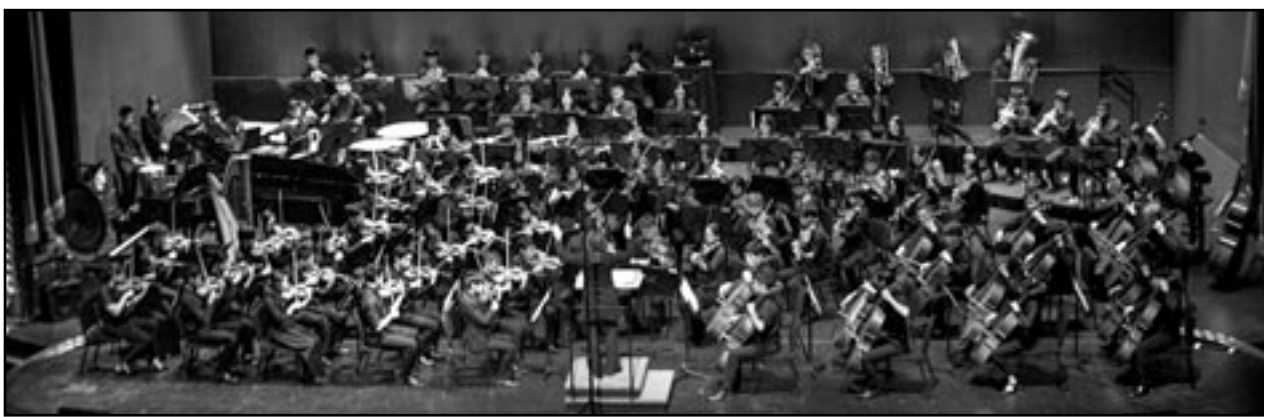
(above) The NJ Youth Symphony, a program of Wharton Arts, will present its 45th Anniversary Celebration Concert on Sunday, May 5 at 3:00 p.m. at the New Jersey Performing Arts Center.