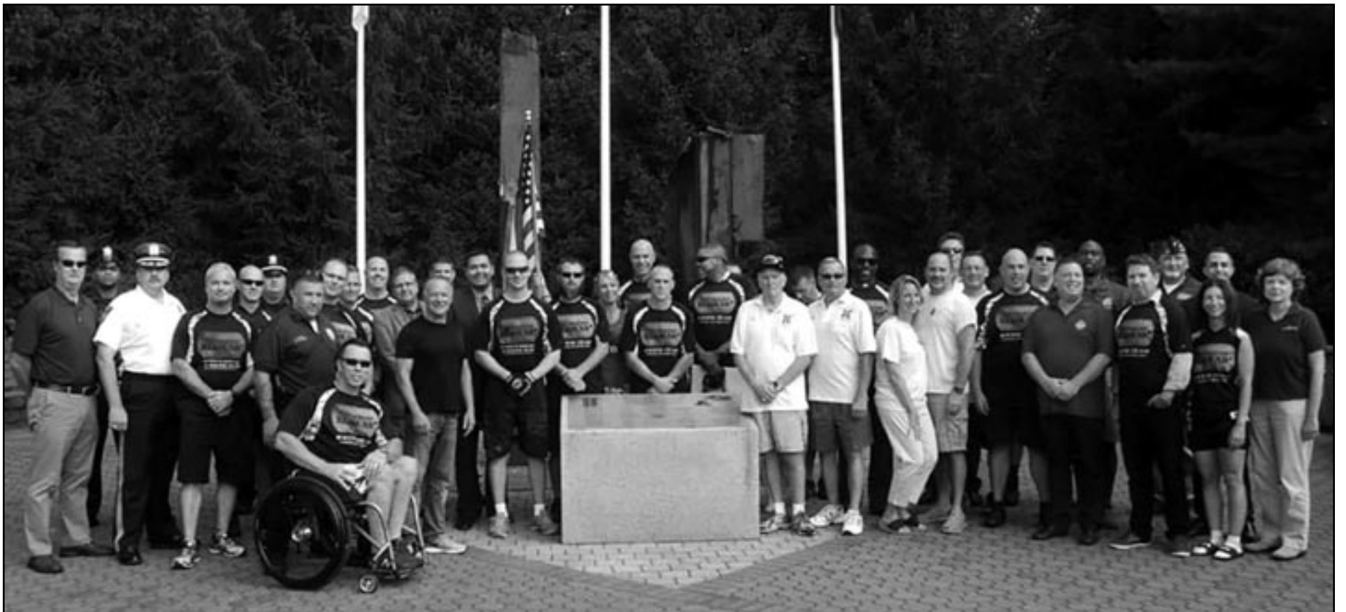
(above) New Jersey Veterans Network veterans and volunteers at a recent event.

We are always looking for volunteers that can both assist with upcoming events and help mentor veterans so they can live better productive lives. Volunteers are the most important NJVN resource, and we would love to have more people help us save lives. If you need assistance or are interested in joining the team, please send us your name, email, and phone number to NJVN1775@gmail.com or call 973-332-1556. Check out our website NJVN.org for our services and accomplishments.