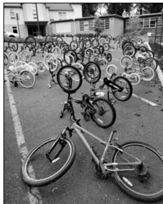
(above) Past bike collection at Faith Lutheran Church. Next collection will be Saturday, June 1, 2024, from 9:00 a.m. to 12:00 p.m.

Street, New Providence, NJ, the phone number is 908-464-5177. Visit online at famfaith.org to learn more about our worship schedule and ministry opportunities.