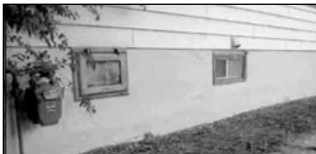
FOUNDATION REPAIRS BEFORE & AFTER