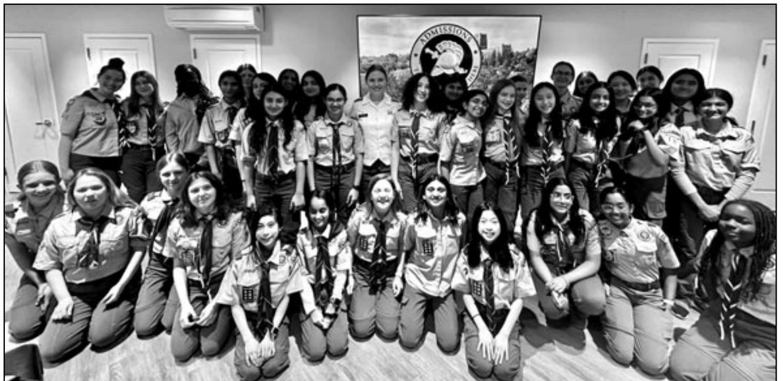
(above) BSA Troop 19, St. Rose of Lima Church - Short Hills, NJ