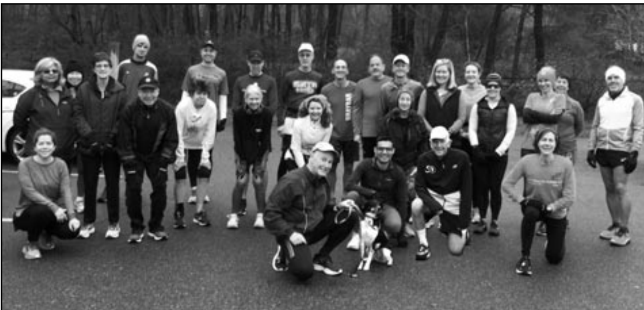
(above) Rose City Runners