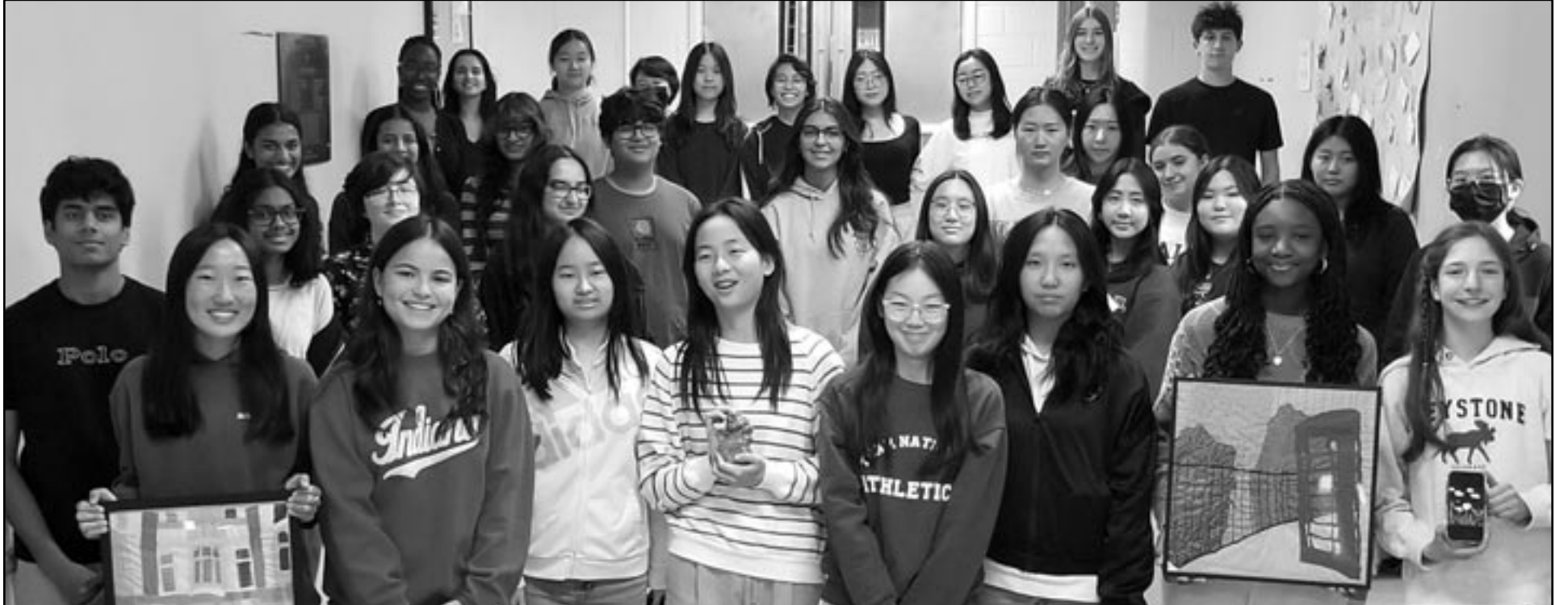
(above) Scholastic Award winners. Mark your calendar now for May 29th for the annual AP Art Show at the high school.

Mark your calendar now for May 29th for the annual AP Art Show at the high school when you will have an opportunity to see the work of these amazing artists.