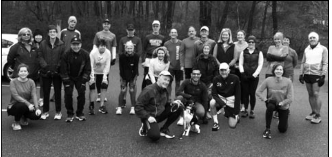
(above) Rose City Runners