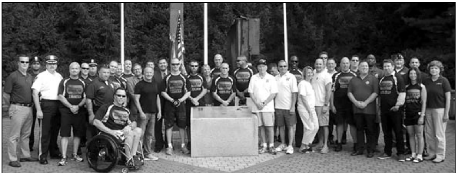
(above) New Jersey Veterans Network veterans and volunteers at a recent event.

Special seating arrangements for Gold Star Mothers will be available at the Hartley Dodge/Borough Hall portion of the ceremony.