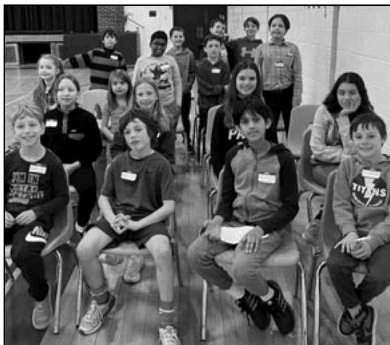
(above) The chess players in the 2024 K of C "Round Robin" Chess tournament.