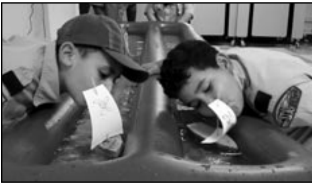
(above) The Cub Scouts of Pack 23 at St. Genevieve's Church built sailboats and raced against each other at Regatta.