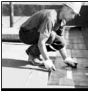
FLAT TOP ROOF