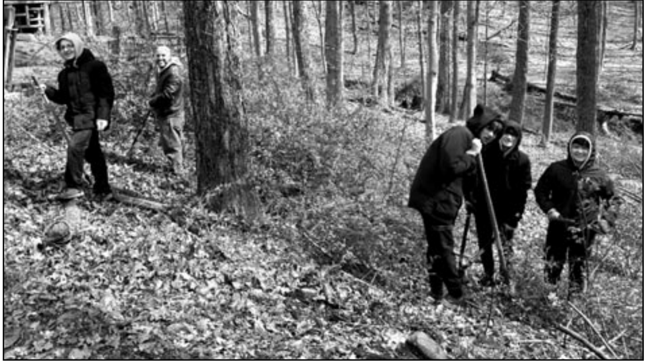
(above) Scouts and leaders of Troop 23, Elizabeth, removed thorny invasive shrubs from the Deserted Village area of the Watchung Reservation.