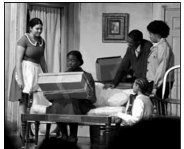
(above) The Thomas Jefferson Arts Academy's Liberty Players cast performing A Raisin in the Sun