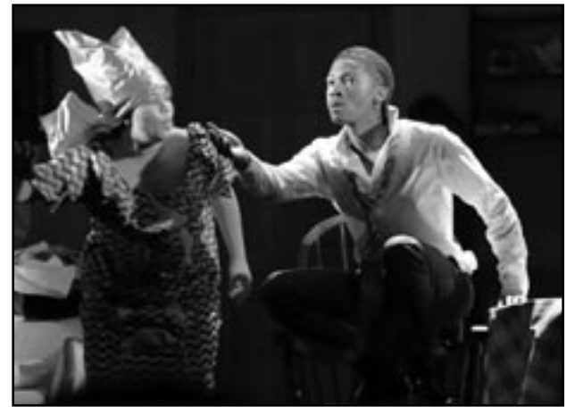
(above) The Thomas Jefferson Arts Academy's Liberty Players have received eight nominations for their production of A Raisin in the Sun. Winners will be announced at the prestigious Montclair State University's Theater Night Awards ceremony on May 20th.

The Thomas Jefferson Arts Academy's Liberty Players' extends their gratitude to Montclair State University's Theater Night Awards for recognizing their achievements and to the community for their unwavering support. Winners will be announced at the Theater Night Awards ceremony on May 20th at 7:15 p.m. in the Memorial Auditorium on the Montclair State University's campus.