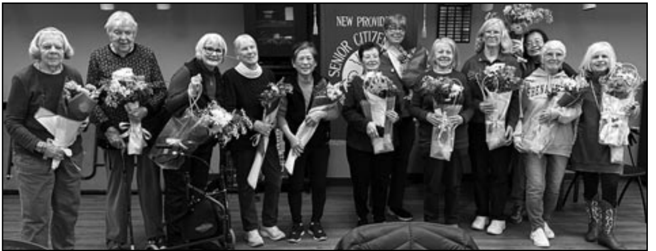
(above) New Providence Senior Citizens recently enjoyed arranging bouquets at a flower bar provided by Unicity Senior Advisors.