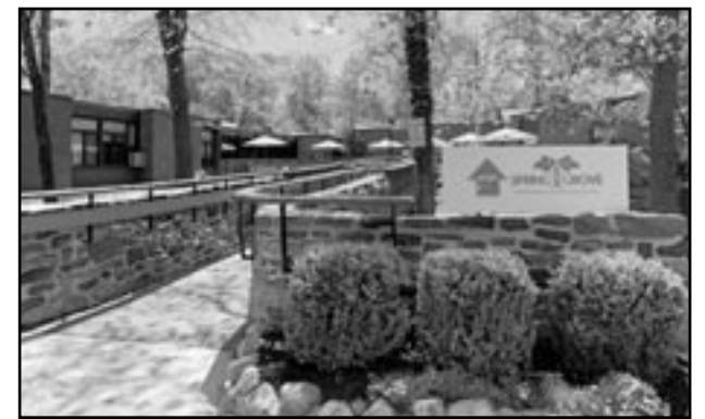
(above) Spring Grove Named Among Nation's Best Nursing Homes for Fourth Consecutive Year. The 106-Bed Center in New Providence, N.J., earned a 2024 High Performance Rating for Long-Term Care.

Brick, N.J.-based Marquis Health Consulting Services provides administrative and consulting services to skilled nursing facilities and senior housing communities along the Eastern Seaboard. The organization's operational guidance enables its client facilities to overachieve their quality and customer service goals by embracing a progressive, multi-specialty approach to healthcare.