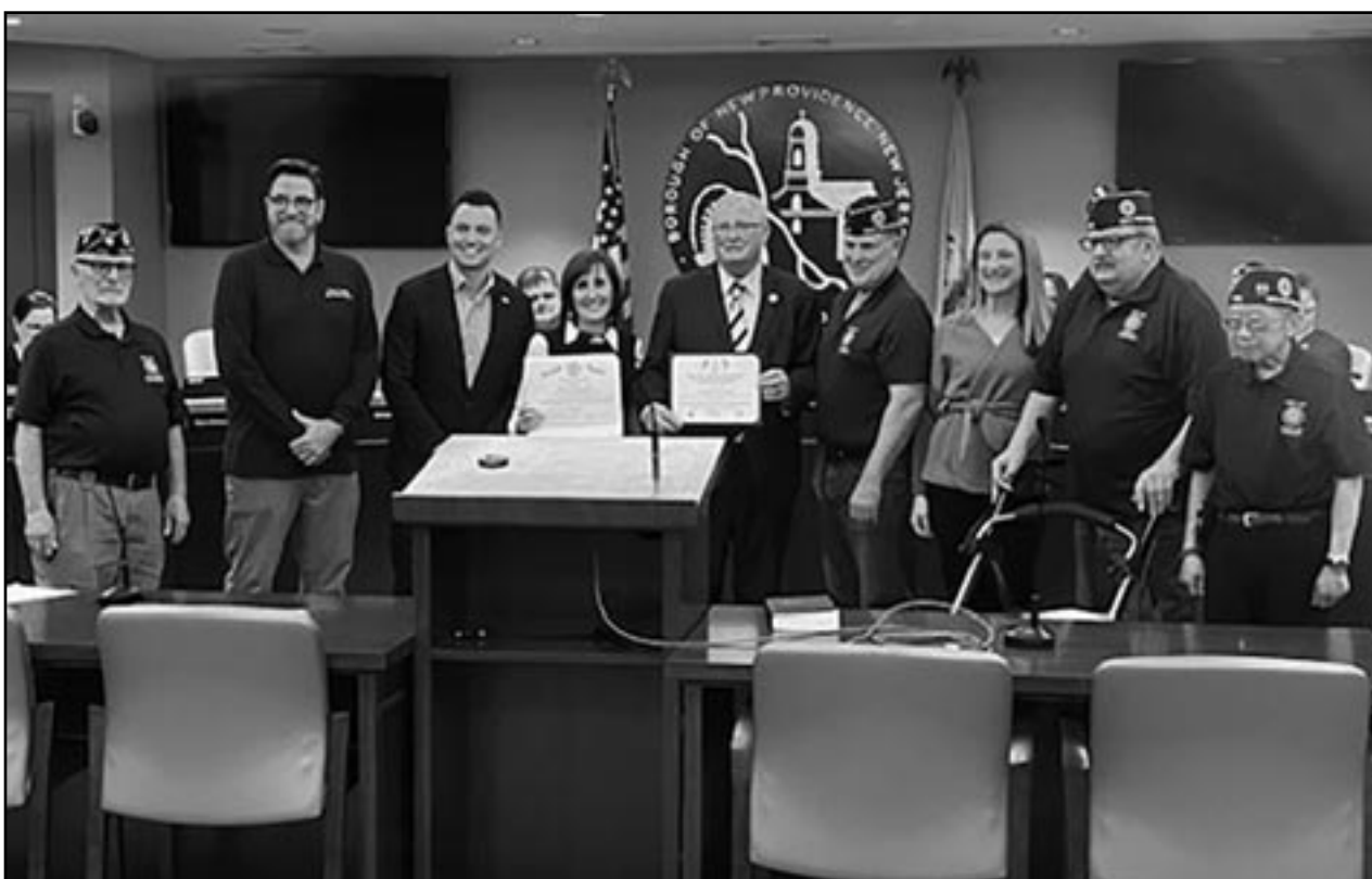
(above) The Borough of New Providence received the esteemed New Jersey Governor's "We Value Our Veterans" Award for their exceptional efforts in acknowledging and honoring the sacrifices and bravery of our service members.