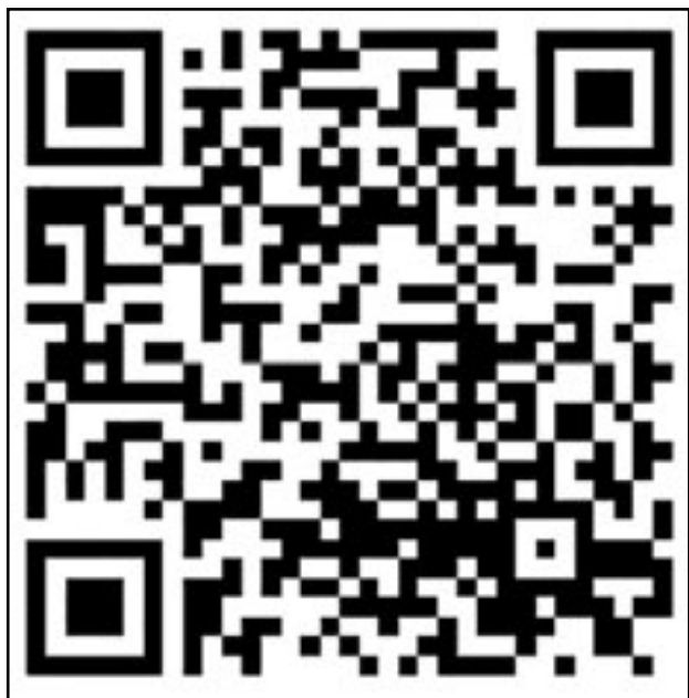
(above) Scan QR Code for Webinar on Talking to Kids about Death and Dying