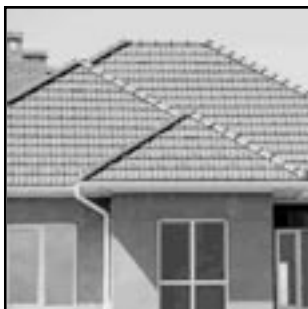
SPANISH STYLE ROOF