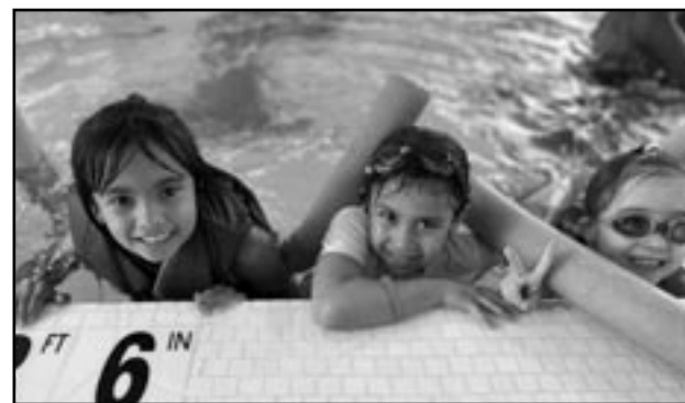
(above) The Gateway Family YMCA is offering Summer Camp Information Sessions

Hosted at The Gateway Family YMCA – Elizabeth Branch, 135 Madison Avenue, Elizabeth, Five Points Branch, 201 Tucker Avenue, Union and Rahway Branch, 1564 Irving Street, Rahway, Summer Camp Parent Information Sessions are scheduled on March 21st 6:00-8:00 P.M., April 20 12:00-2:00 P.M. and May 16 5:00-7:00 p.m. Parents are invited to join YMCA Camp Directors for tips on getting the most out of your child's camp experience, transition from school to camp, summer safety and fun! Advance registration is optional, with