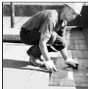
FLAT TOP ROOF