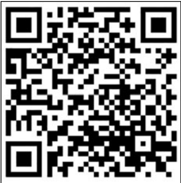
(above) Scan QR Code for Webinar on Talking to Kids about Death and Dying