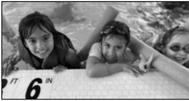
(above) The Gateway Family YMCA is offering Summer Camp Information Sessions

Hosted at The Gateway Family YMCA – Elizabeth Branch, 135 Madison Avenue, Elizabeth, Five Points Branch, 201 Tucker Avenue, Union and Rahway Branch, 1564 Irving Street, Rahway, Summer Camp Parent Information Sessions are scheduled on March 21st 6:00-8:00 P.M., April 20 12:00-2:00 P.M. and May 16 5:00-7:00 p.m. Parents are invited to join YMCA Camp Directors for tips on getting the most out of your child's camp experience, transition from school to camp, summer safety and fun! Advance registration is optional, with