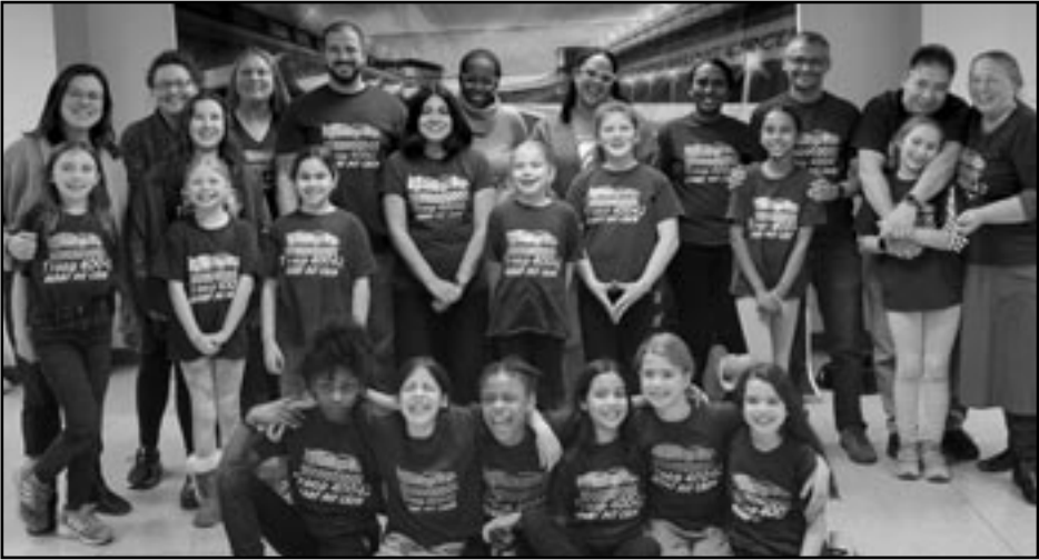
(above) Girl Scouts of Cranford 4th Grade Junior Troop 40042

This year in preparation for the event to ensure all Girl Scouts had an opportunity to participate no matter of their access to tools, Girl Scout Junior Troop 40042 held two new design and carpentry workshops to assist Girl Scouts and their families with the safe building of their wood car creations. Girl Scout attendees received hands-on experience with tools and carpentry