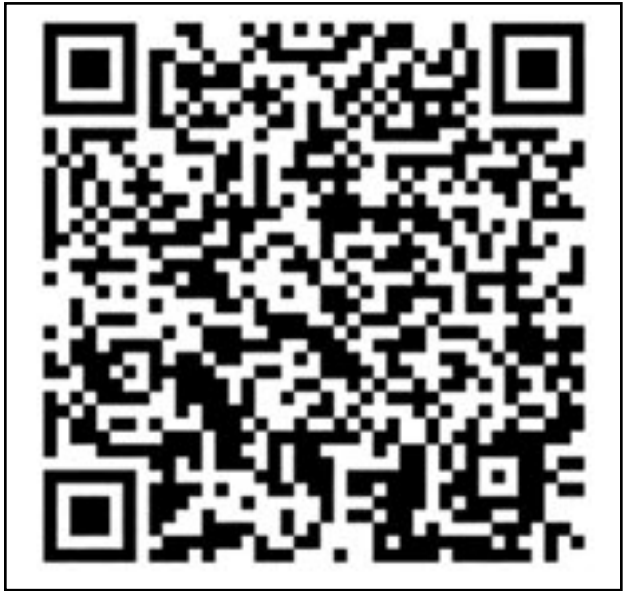
(above) Use the QR code to apply. The deadline is May 1, 2024.

The scholarship is not based on financial need. The candidate must furnish proof of acceptance/enrollment to an accredited university, a letter of reference, and an essay. The deadline to apply is May 1, 2024. To apply visit:cranfordlibrary.org/friends.php.