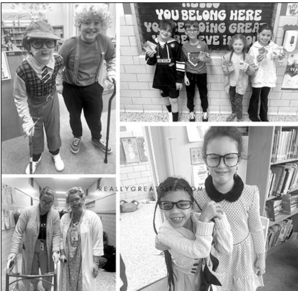
(above) "Kindness never gets old" spirit day where students and staff were invited to dress up.