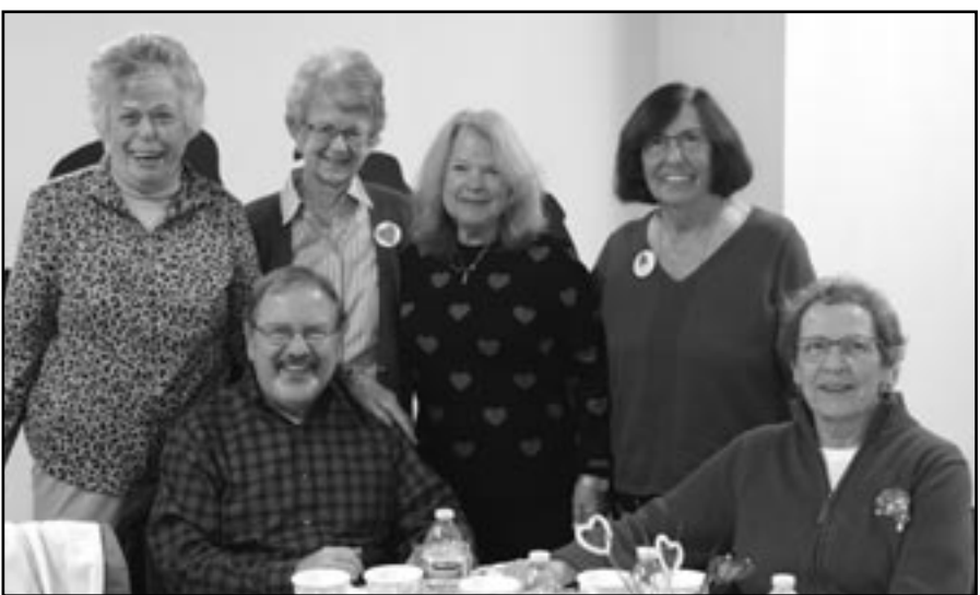
Photos from this and other events can be found online at rennamedia.com and on Berkeley Heights Community News page on facebook.com Feel free to "Like," "Tag," and "Share."