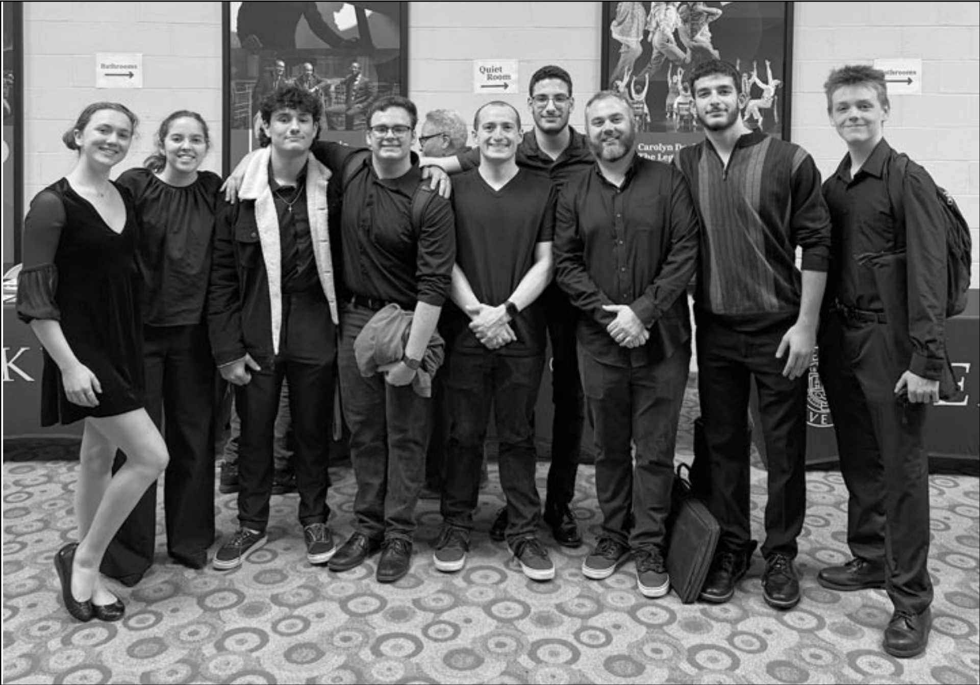
(above) GLHS Percussion Ensemble