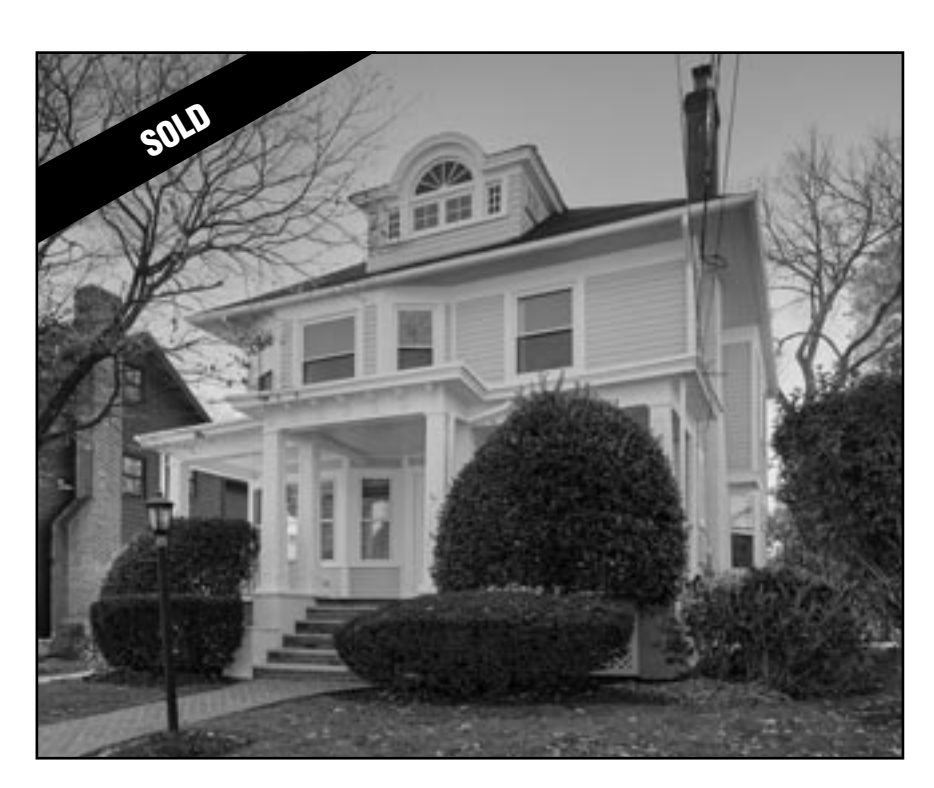
405 Harrison Avenue, Westfield 5 Bedrooms | 2.2 Baths | $999,000