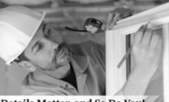
Details Matter, and So Do You!

We supply Contractors, Architects and Homeowners with the highest quality building products. See our website for more details. MARVIN @