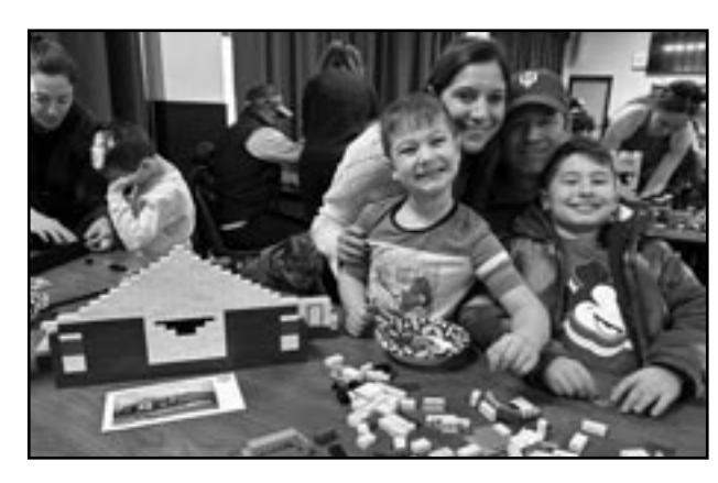
(above) Temple Emanu