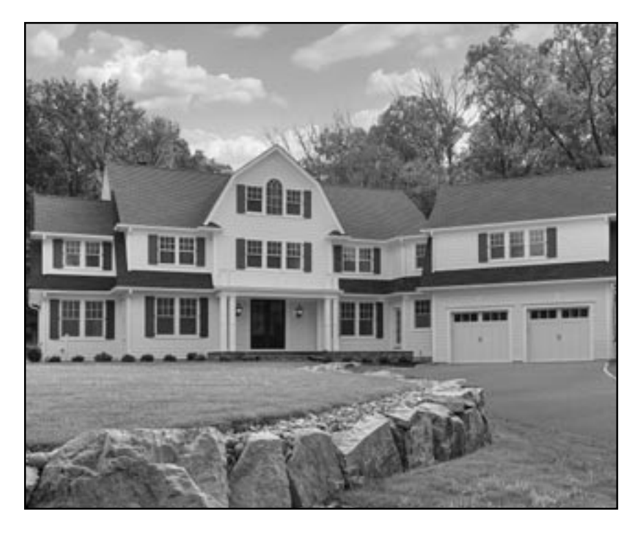
153 Wild Hedge Lane, Mountainside 6 Bedrooms | 6.1 Baths | $2,850,000