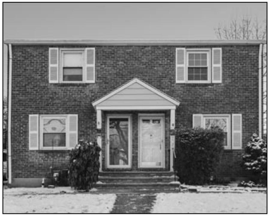
1043 South Avenue West, Westfield 2 Bedrooms | 1 Baths | $350,000