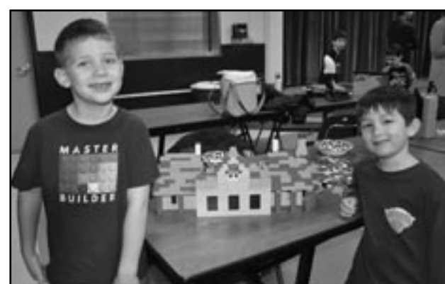
(above) Train Station