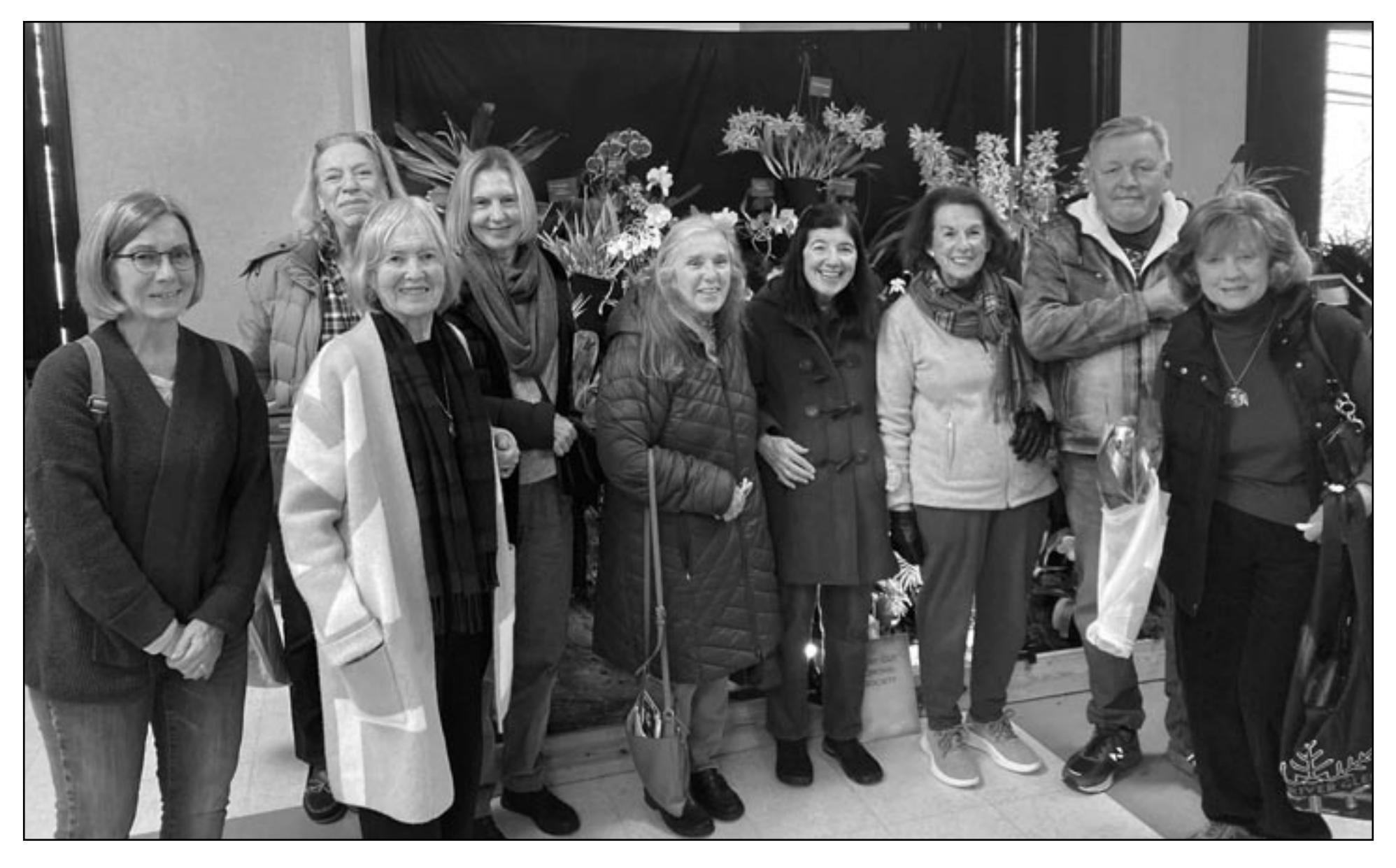
Club members visited Orchid Show at Rutgers University in January. The orchids were gorgeous!

The Garden Club of Westfield celebrated the New Year with a "Soup's On" lunch and program about Campbell Soup and the types of tomatoes, advertising and art that contributed to making Campbell's Tomato Soup an American icon.