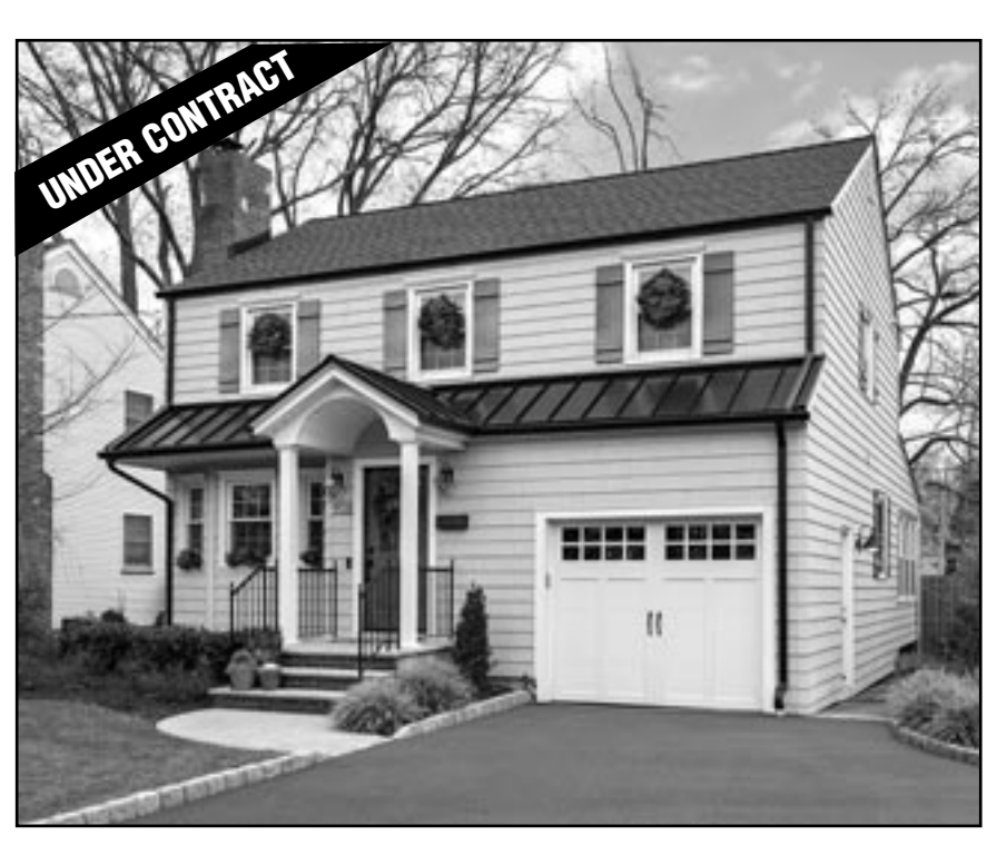
908 Harding Street, Westfield 3 Bedrooms | 2 Baths | $999,000