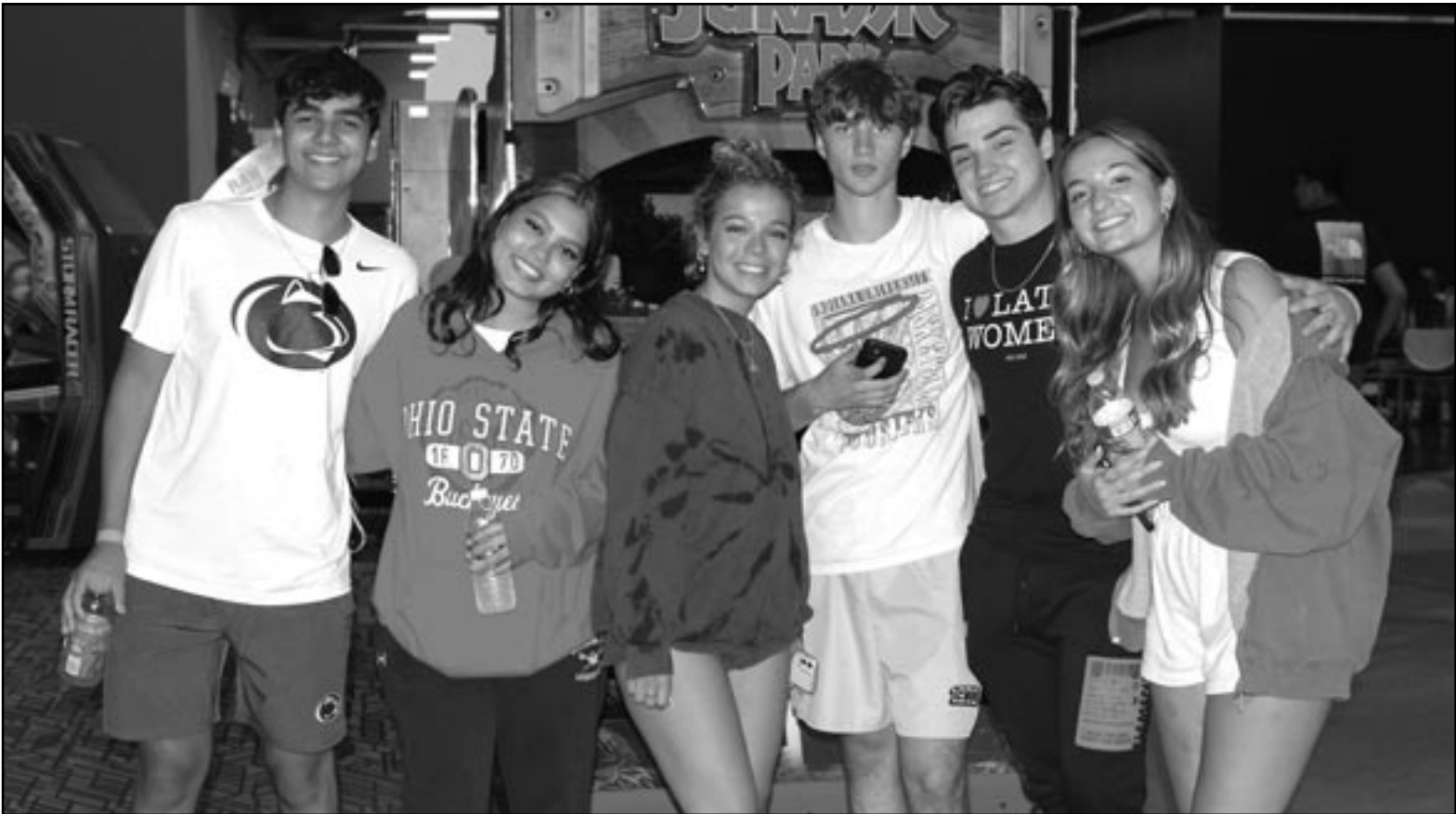
(above) Photo from Watchung Hills Regional High School Class of 2023 Project Graduation