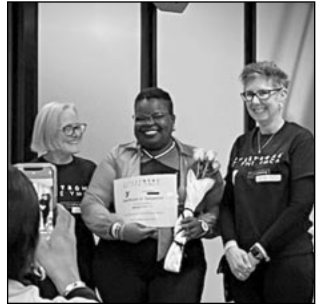
(above) The Gateway Family YMCA celebrated LIVESTRONG® AT THE YMCA Graduation