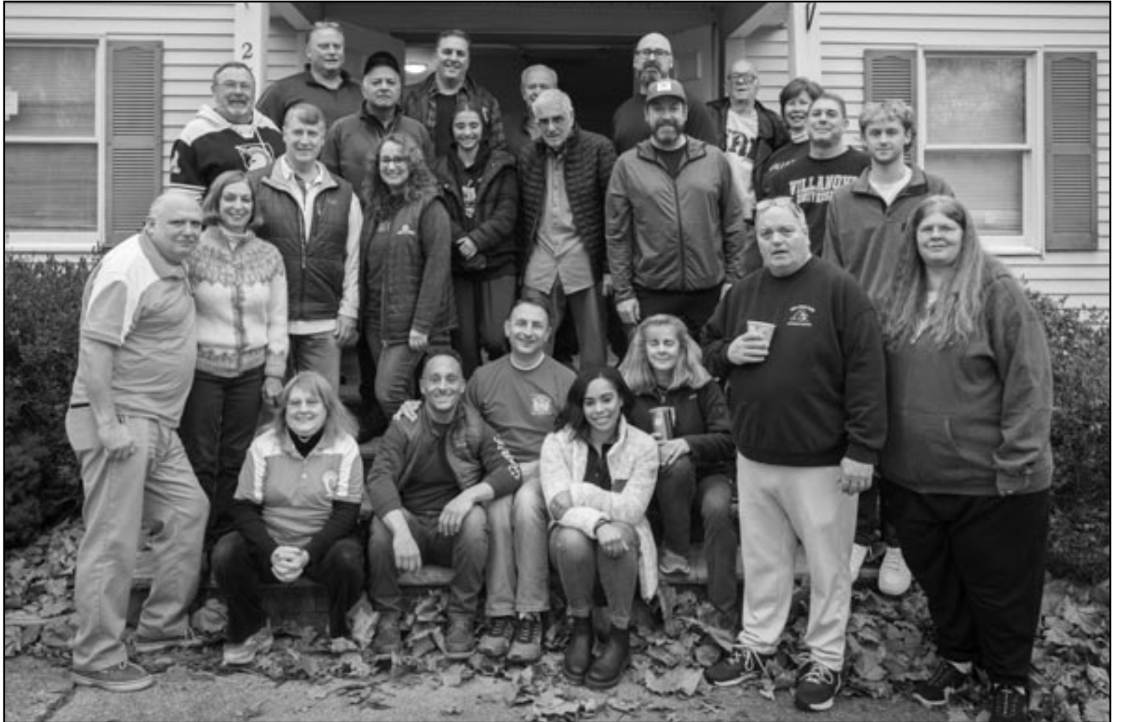
(above) Area Elks and volunteers - Elks Care and Elks Share.