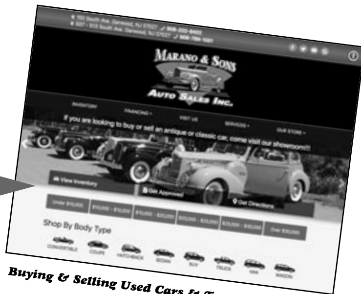
Buying & Selling Used Cars & Trucks Since 1955

Visit our website to value your car MaranoSonsAuto.com