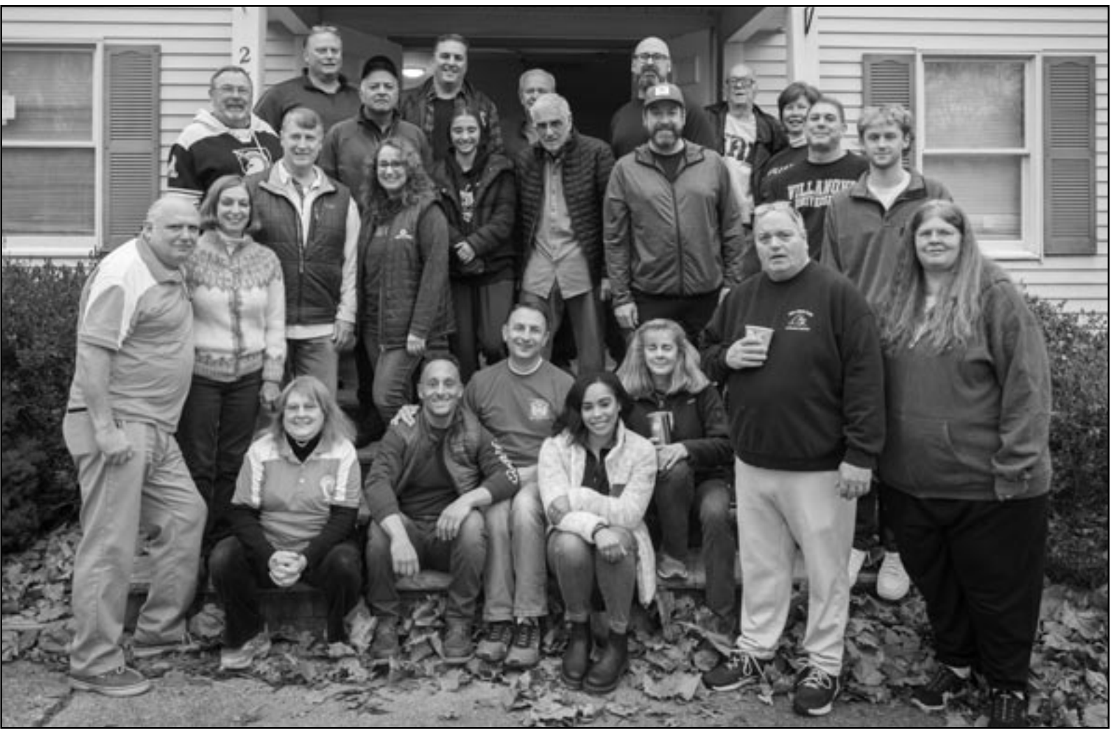
(above) Area Elks and volunteers - Elks Care and Elks Share.

Recently, twenty-five area Elks and volunteers helped to restock the shelves at the NJ State Elks Veterans Annex in Stirling. The items that were received will be assembled into Welcome Home Kits and delivered free of charge to previously homeless Veterans who are moving into a new residence.