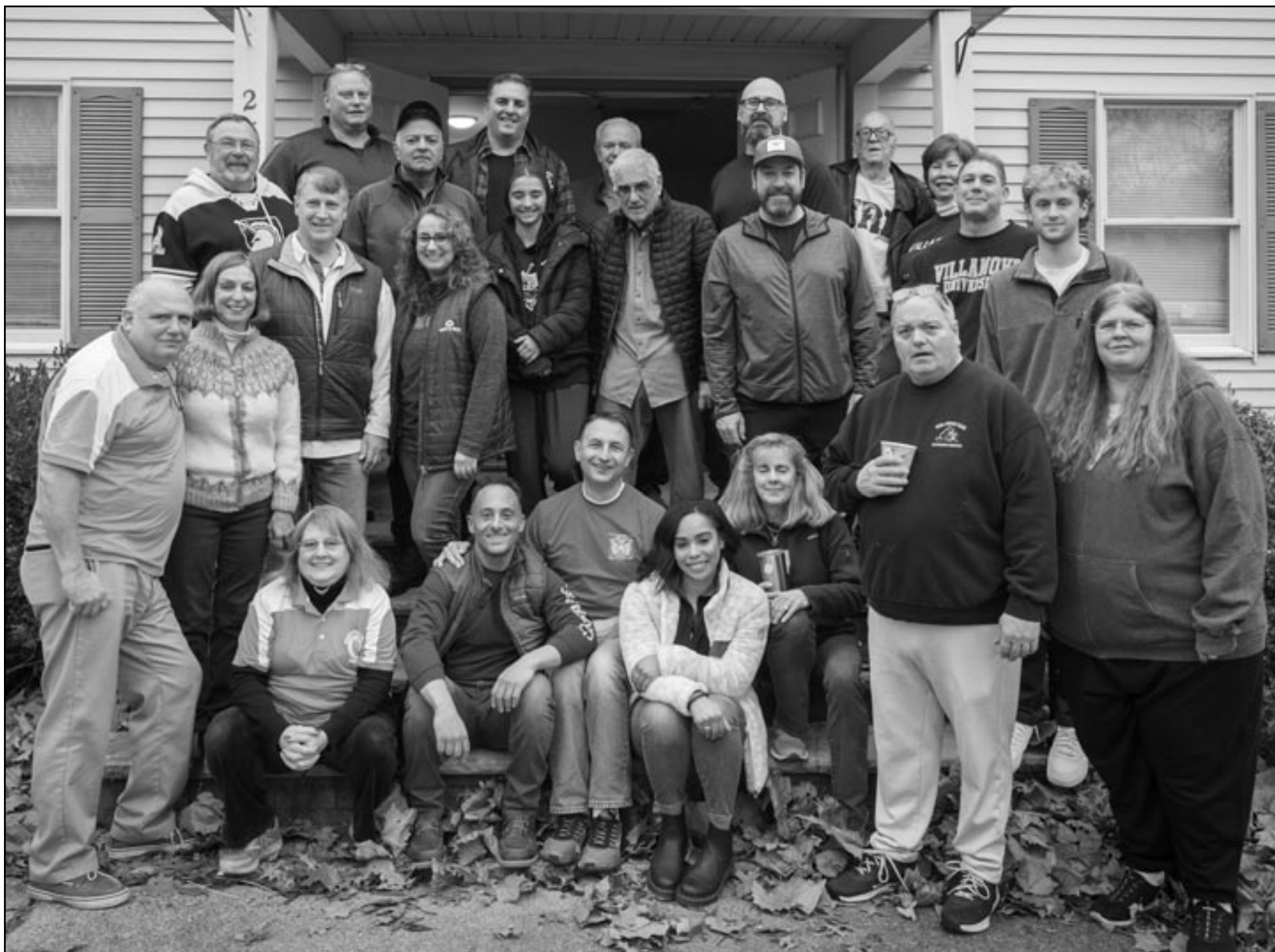
(above) Area Elks and volunteers - Elks Care and Elks Share.

Please email njelksnvsc@gmail.com to learn more about what New Jersey State Elks do to help veterans and visit Elks.org for more information about the Elks and how to join.