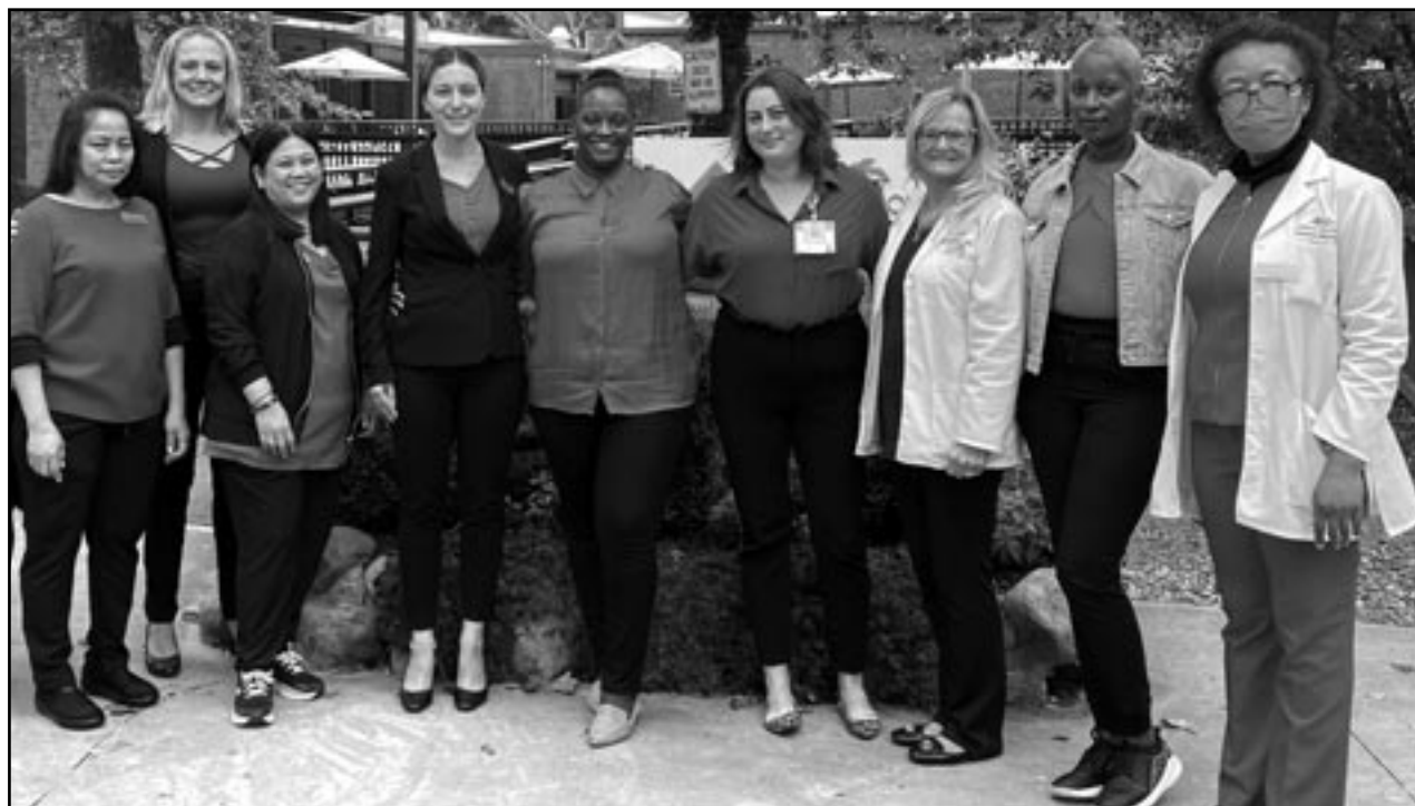
(above) Spring Grove Rehabilitation & Healthcare Center's interdisciplinary care team

Brick, N.J.-based Marquis Health Consulting Services provides administrative and consulting services to skilled nursing facilities and senior housing communities along the Eastern Seaboard. The organization's operational guidance enables its client facilities to overachieve their quality and customer service goals by embracing a progressive, multi-specialty approach to healthcare.