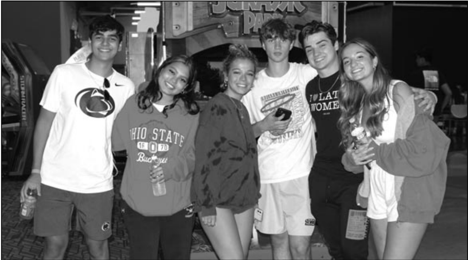
(above) Photo from Watchung Hills Regional High School Class of 2023 Project Graduation