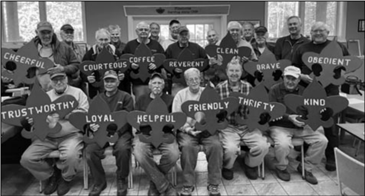
(above) Flintlocks holding the 12 points of the Scout law signs. (with one extra)