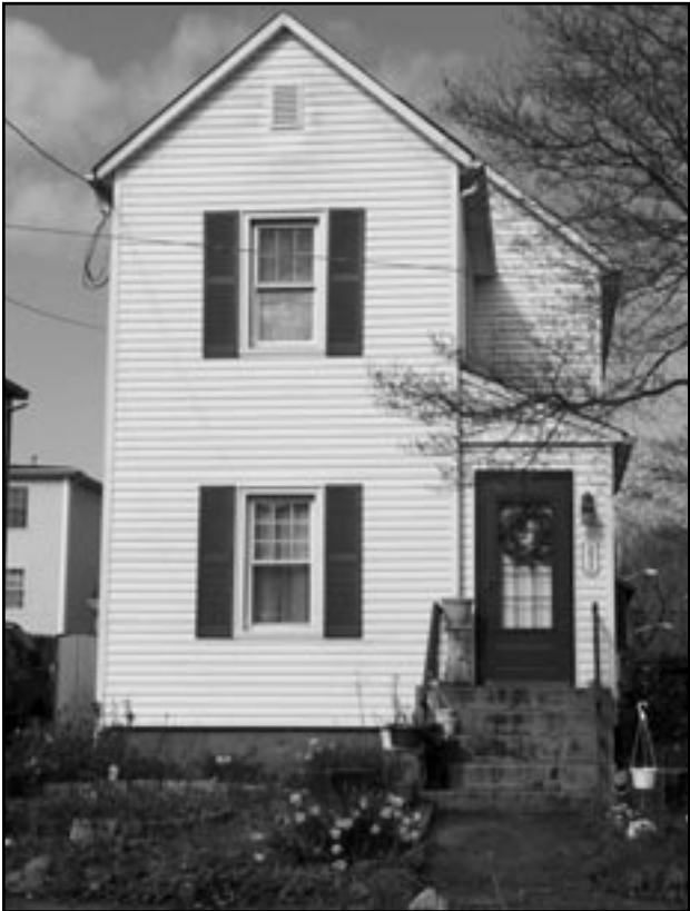
(above) 7-room model, $1,600 (N. 9th St.)