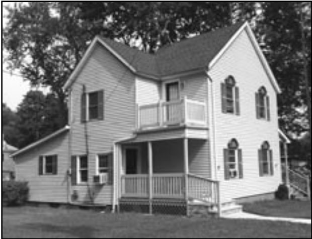
(above) Duplex model, $2,200 (N. 10th St.)

Houses” as the impetus for their erection was to shelter the many Jewish families to be brought to New Orange – the predecessor of Kenilworth – by the De Hirsch Fund. The De Hirsch Fund sought factory jobs here for Jewish people who it brought to the United States from eastern Europe – mainly Russia – to escape religious persecution. By 1899 Hopkins was far behind schedule having completed only 40 units. At this pace the Association knew its business venture could be doomed. In desperation, another builder was sought to build the remaining 100 houses – but it had to be done in just 100 days. That summer James Arthur of Philadelphia was contracted to build those 100 houses in 100 days. Arthur, who built more than a thousand homes in the Philadelphia area, was up to the challenge. Arthur recruited tradespeople to form “work gangs.” Many lived in tents and vacated farm