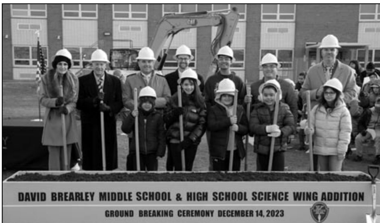
(above) Current fourth grade class will be first sixth graders to attend expanded Brearley Middle-High School.

Work is already underway on other bond referendum projects, including athletic field upgrades and efficient HVAC units for every classroom. Renovations are also planned for the Harding and Brearley auditoriums. Parts of the Harding auditorium have not been updated since the school was built a century ago.