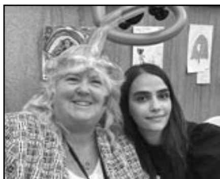
(above) Festivities included a balloon artist; personalized cupcakes; and ice cream, face painting, and friendship-bracelet making stations.