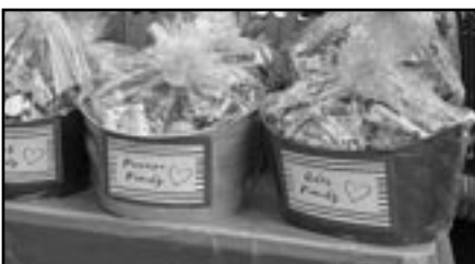
(left) Each family received a basket made possible by CASA of Passaic and Union Counties & the David Brearley Middle High School Bears That Care Program.

time coming for these sisters, and it was amazing," she said. "I've been their advocate since 2020. Between their adoptive families and all involved, embraces and cheers were aplenty. My time as their CASA volunteer was both rewarding and challenging. I'm thankful I could help ensure their needs were met and services were provided while in care."