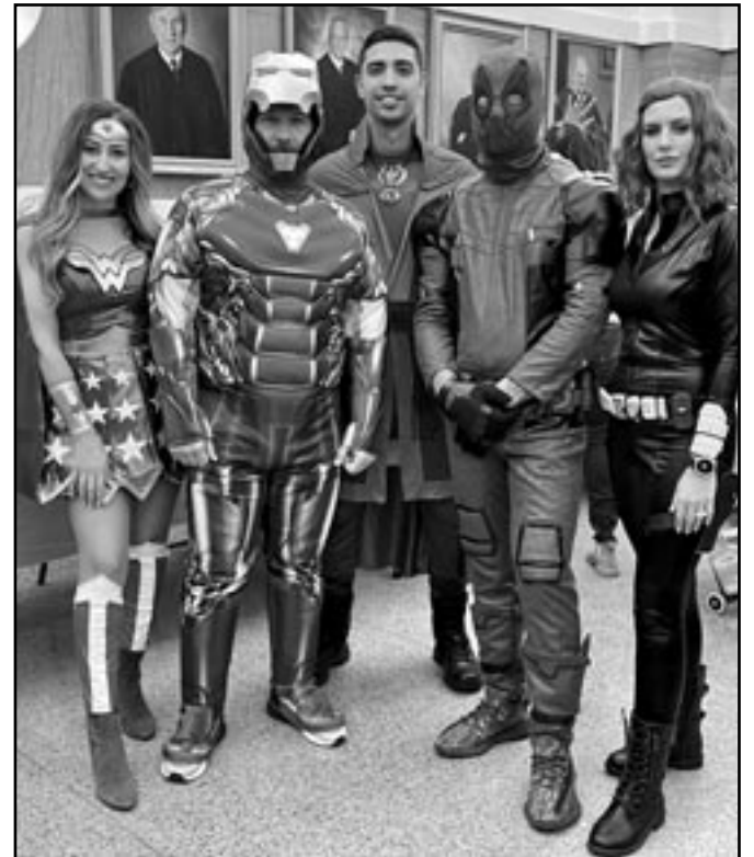
(above) Sheriff's officers dressed as superheroes, and maned a Batmobile outside the courthouse.