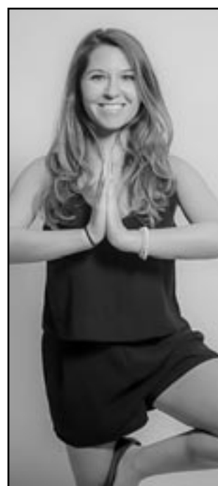
(above, l-r) Read To A Dog - Feb 27, Yoga Story Time - Feb 14