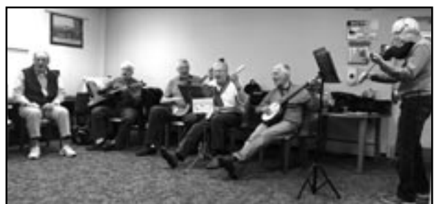
(above) Good Tyme String Band - Feb 28