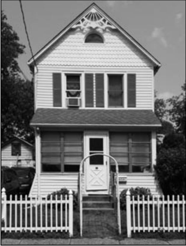
(above) 6-room model, $1,300 (N. 8th St.)

Sources: Historic Signs Inc., photos taken 2015