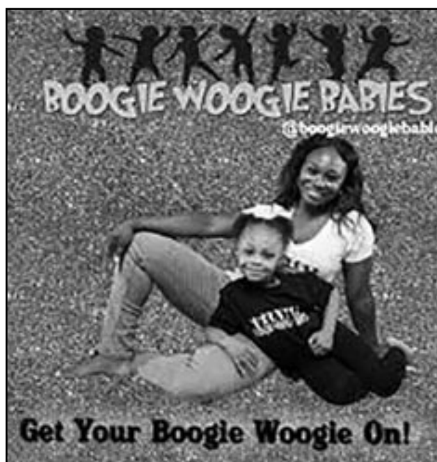
(above, l-r) Boogie Woogie Babies - Feb 13

Registration is required for each individual craft one week prior to each craft.