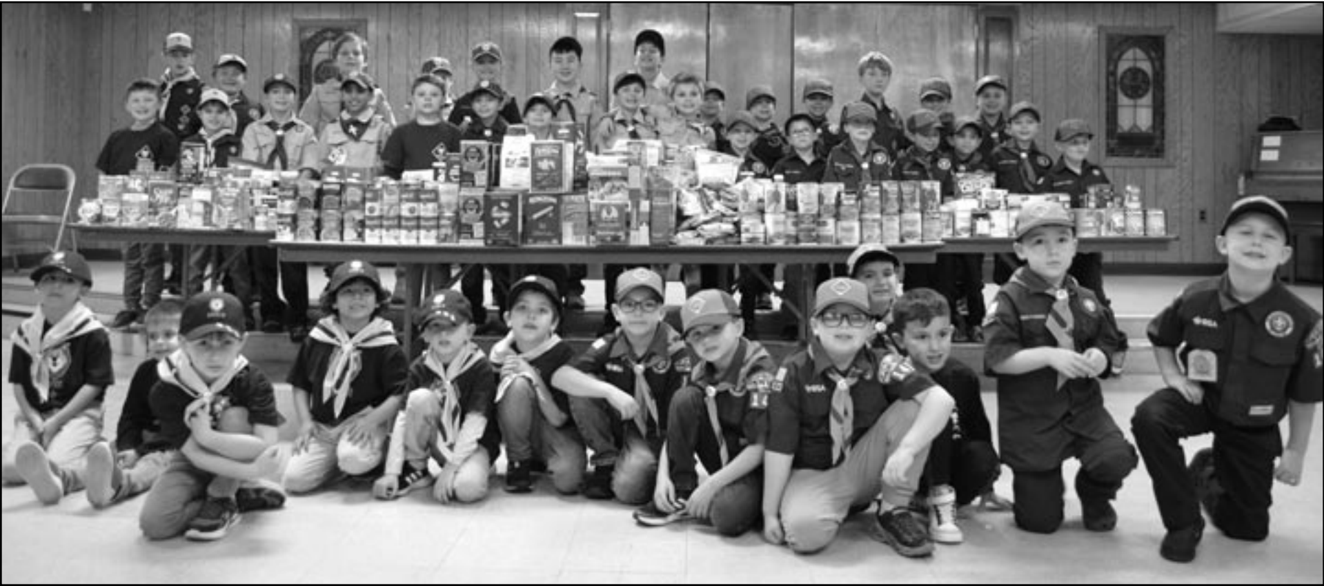
(above) Cub Scout Pack 145 Goes Scouting For Food

of food items were gathered to donate to the Clark church that Pack 145 has supported over the past several holiday seasons. Pack 145 thanks all families, friends, neighbors, and community members for their generous donations that helped the scouts achieve their goal of supporting the Osceola Presbyterian Church food pantry and those who depend on its vital resources.