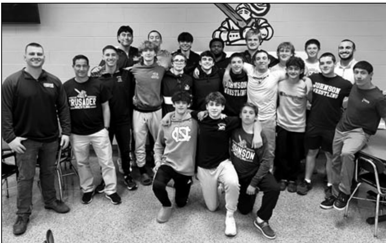
(above) ALJ Wrestling

Congrats to all of our wrestlers on an outstanding showing in the County Championships!