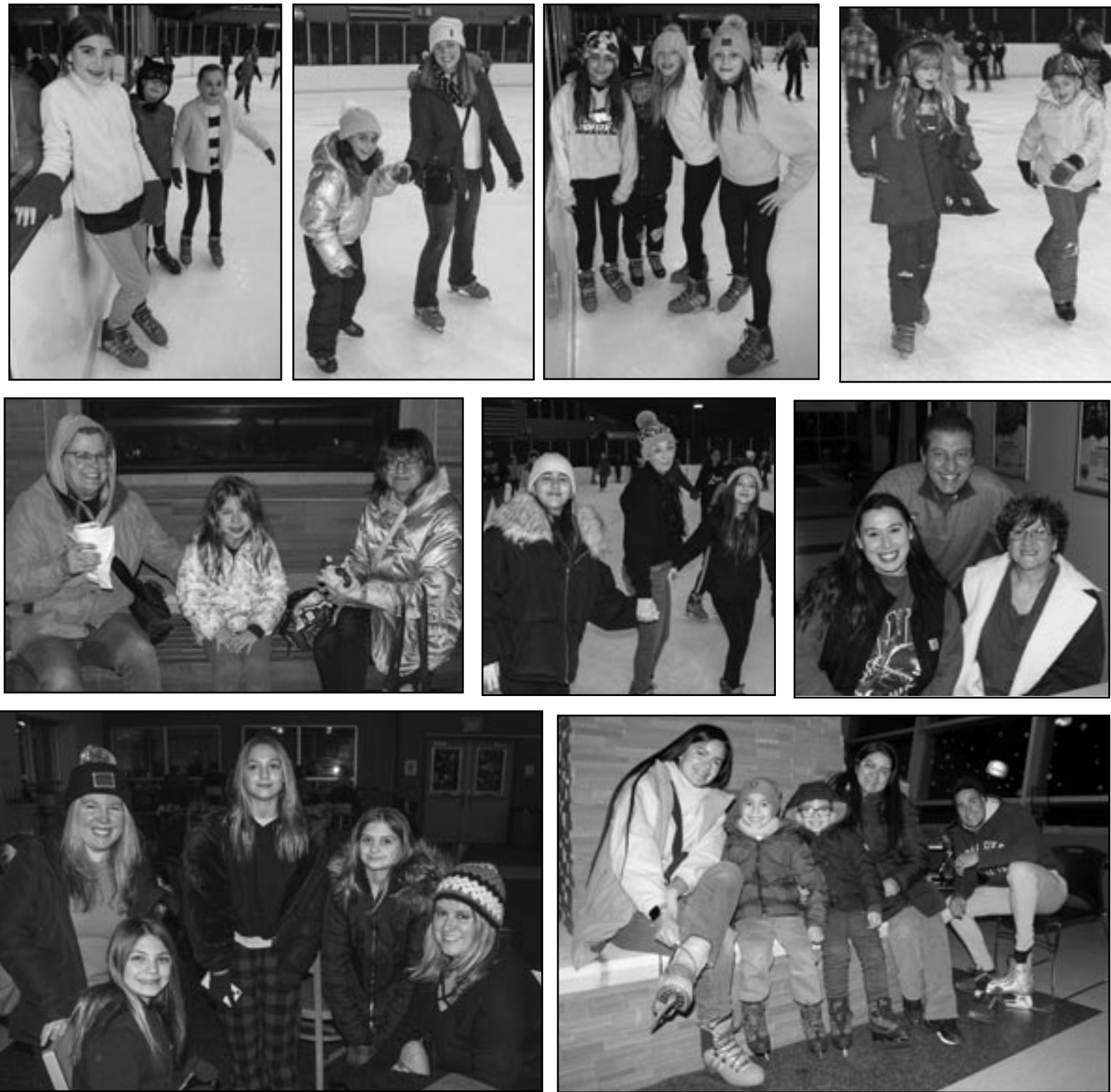
Clark Recreation held their 18th Annual Family Skate Night at Warinanco Skating Rink on Saturday, January 13th. Over 200 skaters took to the ice and had a great time.

Photos from this and other events can be found online at rennamedia.com and on Clark Monthly page on facebook.com Feel free to “Like,” “Tag,” and “Share.”