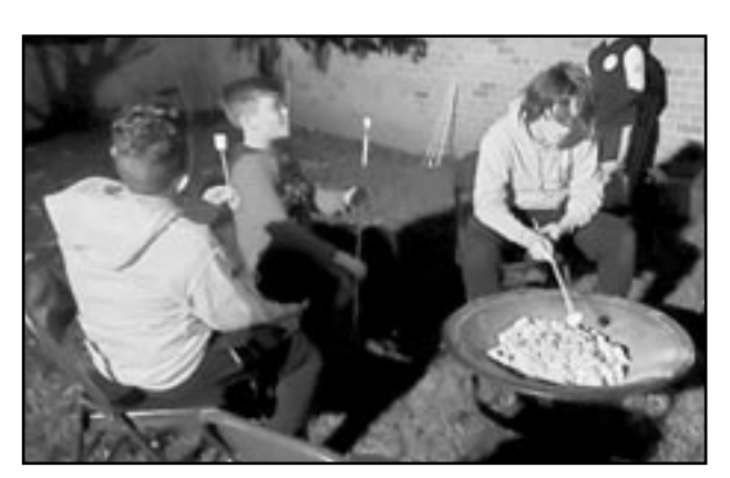
(above) Scouts and their guests roasted marshmallows on an outdoor campfire at Webby's Fun Fest.