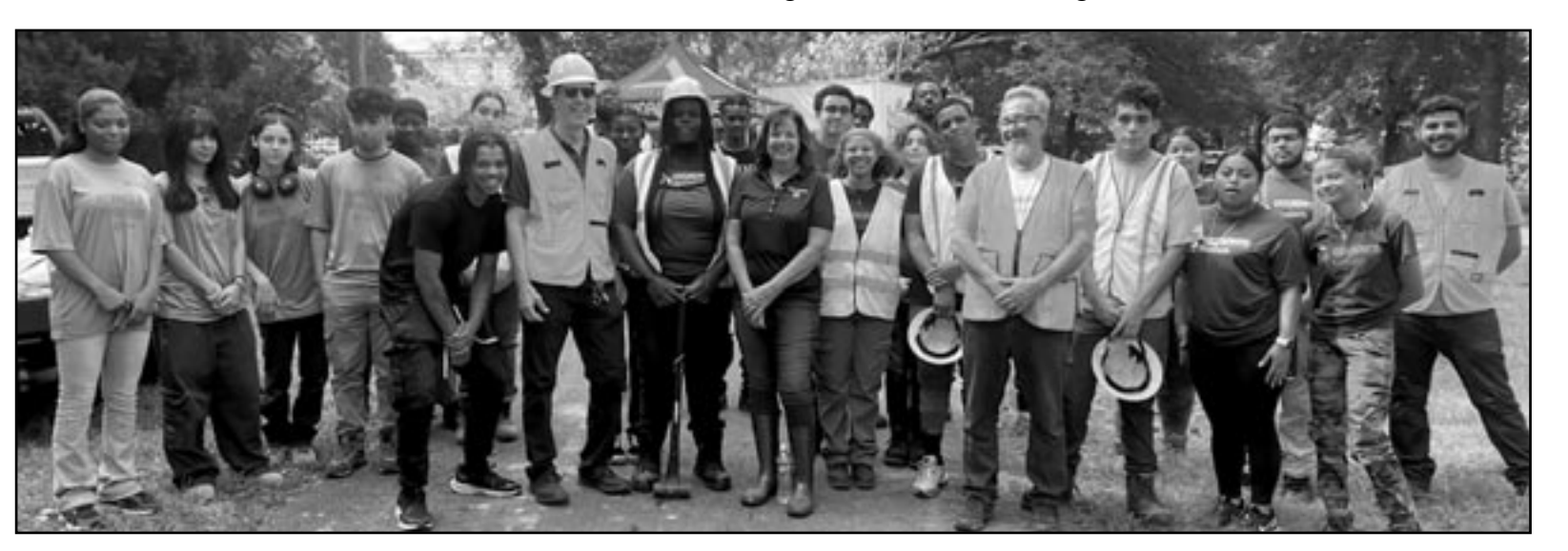
(above) Groundwork Team joined by Phillips 66 team members at Trotters Branch of the Elizabeth River site.

The park was closed for work from July through midabout this project and more information on Groundwork, visit groundworkelizabeth.org.