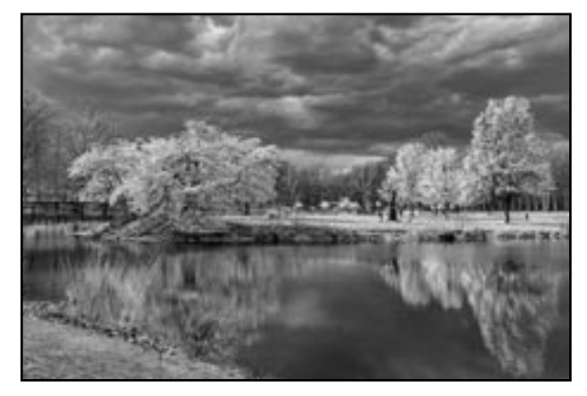
(above) Stormy Spring Skies-Nomahegan Park

The exhibit is free and open to the public during regular library hours. For more information call 908-276-2451.