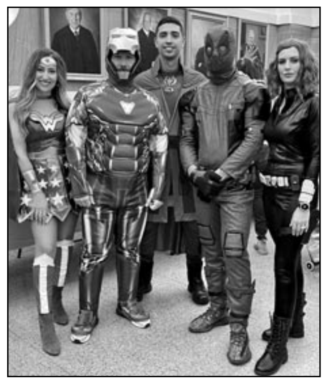
(above) Sheriff's officers dressed as superheroes, and maned a Batmobile outside the courthouse.

(left) Each family received a basket made possible by CASA of Passaic and Union Counties & the David Brearley Middle High School Bears That Care Program.