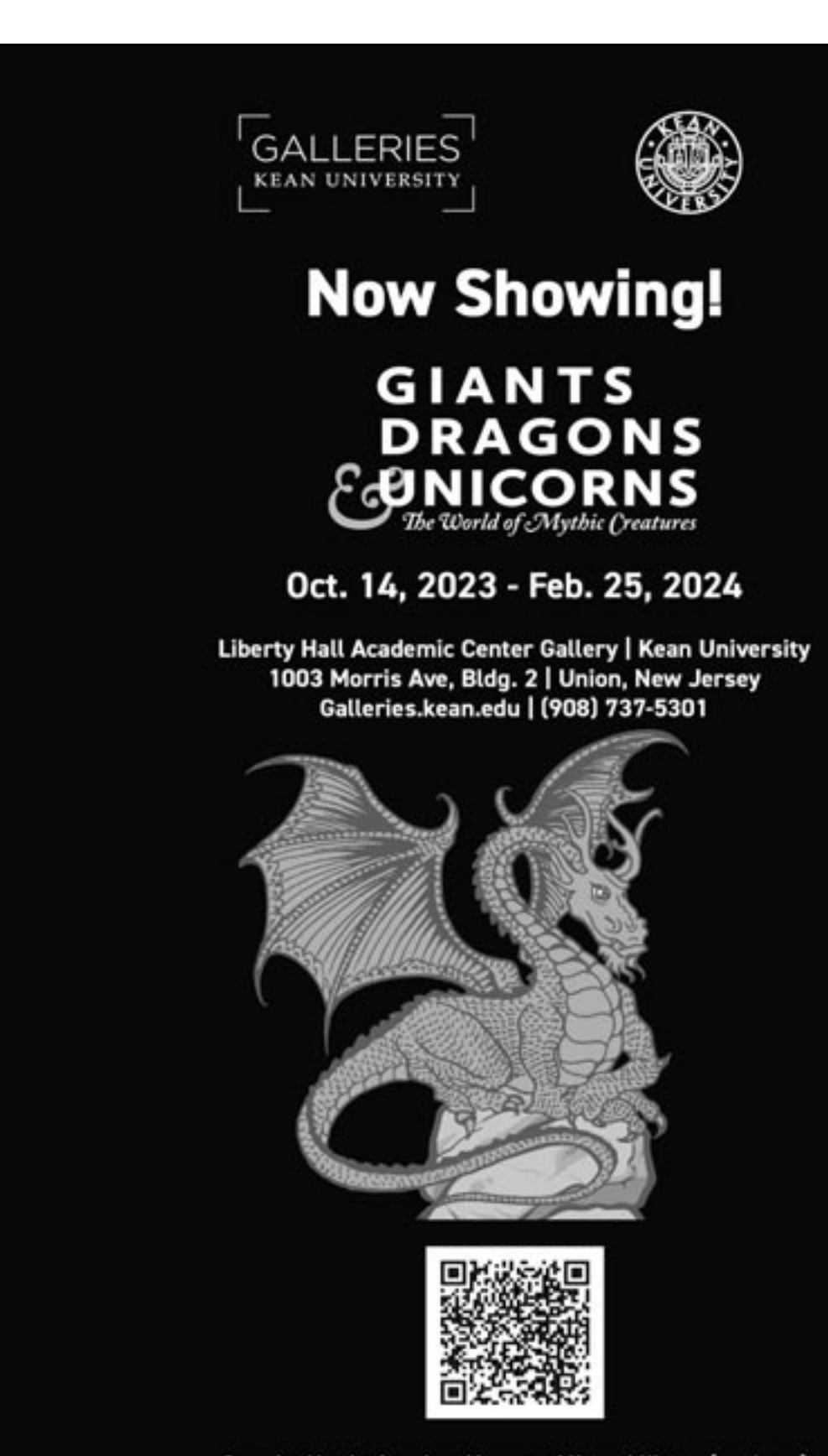
Organized by the American Museum of Natural History (amnh.org).