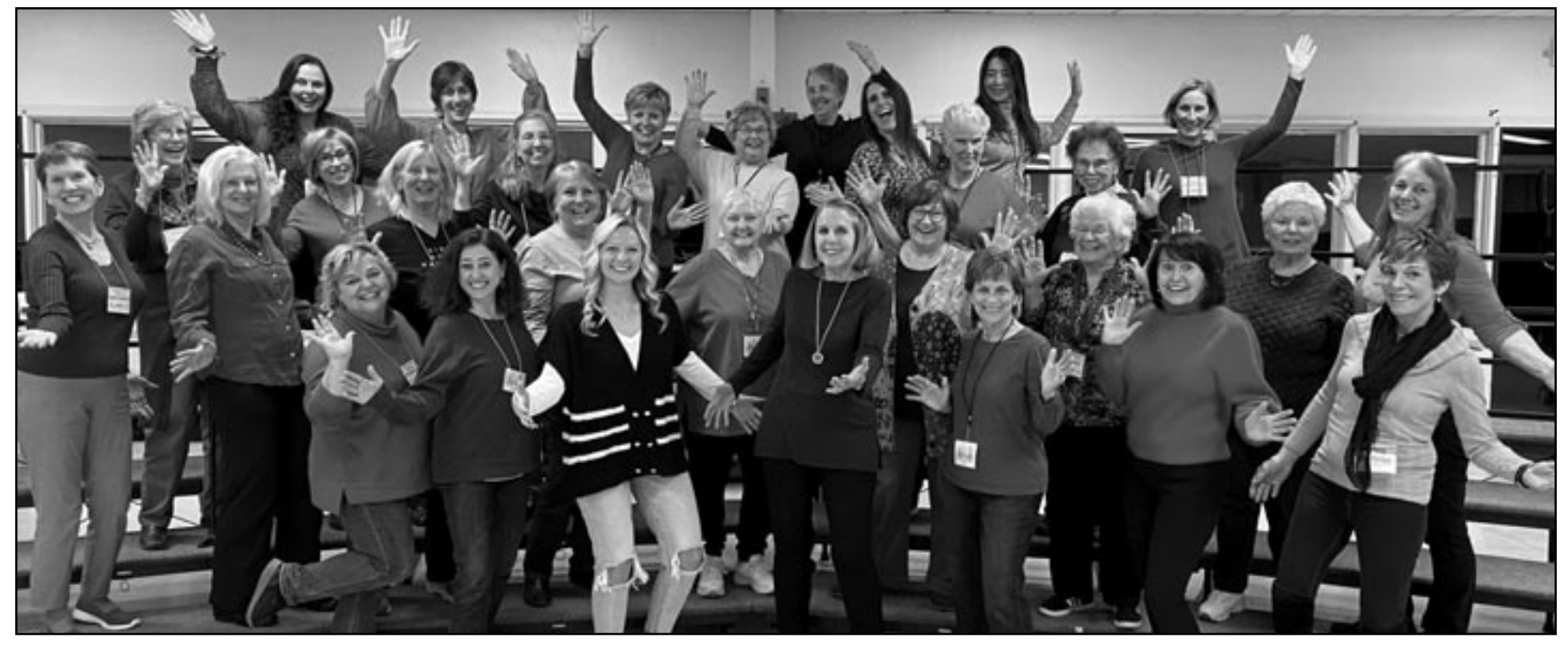
(above) The Hickory Tree Chorus invites the public to sing with them at an Open House, on January 10 and 17, from 6:45 to 9:30 p.m.

Find more information at hickorytreechorus.org.