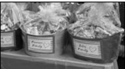
(left) Each family received a basket made possible by CASA of Passaic and Union Counties & the David Brearley Middle High School Bears That Care Program.

time coming for these sisters, and it was amazing," she said. "I've been their advocate since 2020. Between their adoptive families and all involved, embraces and cheers were aplenty. My time as their CASA volunteer was both rewarding and challenging. I'm thankful I could help ensure their needs were met and services were provided while in care."