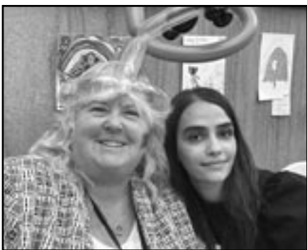
(above) Festivities included a balloon artist; personalized cupcakes; and ice cream, face painting, and friendship-bracelet making stations.