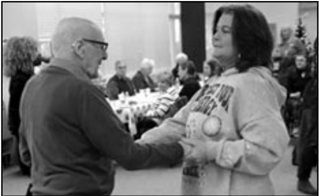
(above) Dancing in your seats or on the dance floor