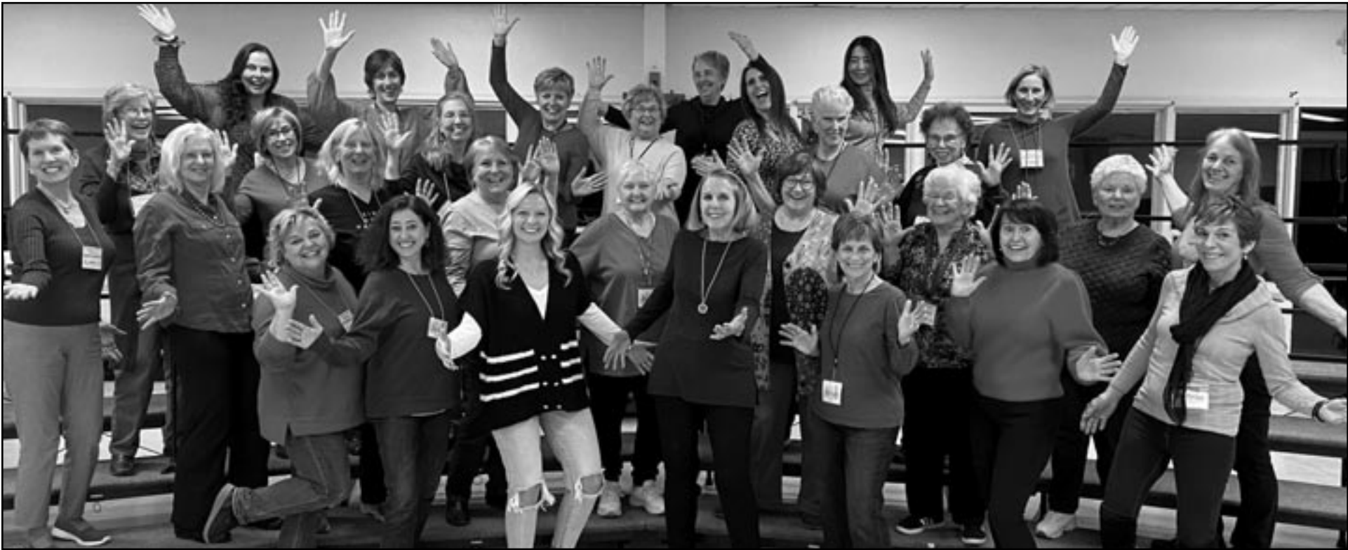
(above) The Hickory Tree Chorus invites the public to sing with them at an Open House, on January 10 and 17, from 6:45 to 9:30 p.m.

Find more information at hickorytreechorus.org .