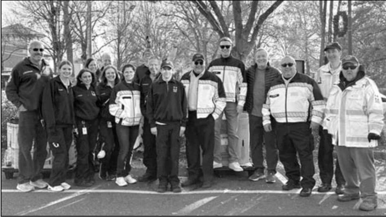
(above) The Squad provided ambulance coverage at two community events in Summit as well as much of the manpower for the Summit Frozen Turkey Drive held in November.

The all-volunteer First Aid Squad, responds to emergency calls 24/7, is entirely funded through private donations and does not bill for service. The Squad is always looking for new volunteers to join its ranks. All needed training, uniforms and equipment is provided. For information on becoming a volunteer, or donating to the squad please call 908-277-9479, or visit their web site at: summitems.org .