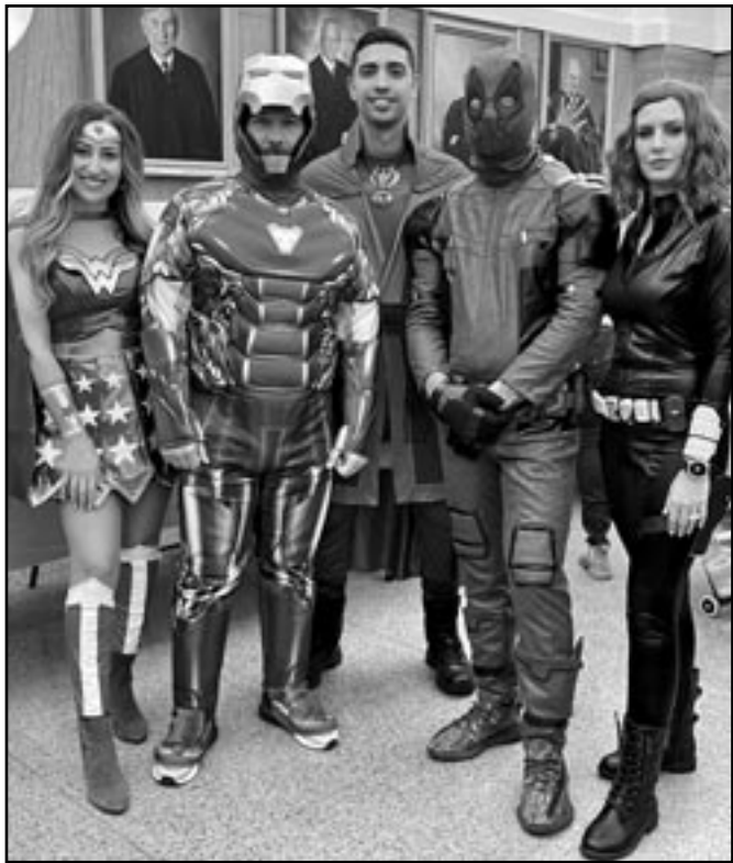
(above) Sheriff's officers dressed as superheroes, and maned a Batmobile outside the courthouse.