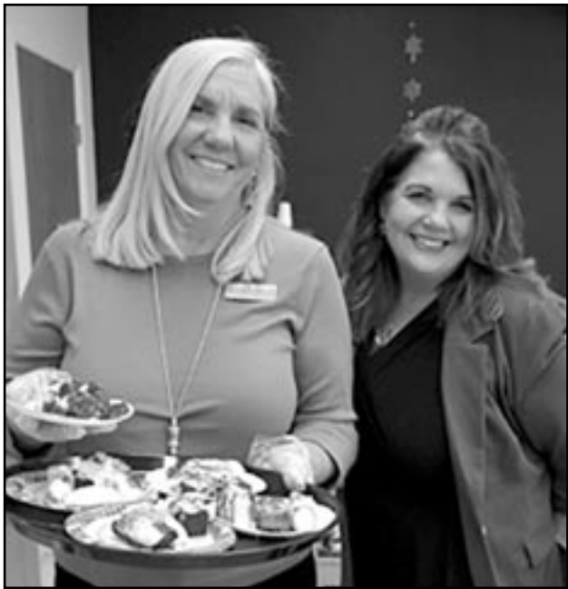
(above) The Senior Center of the Chathams hosted Holiday Parties on two days – November 30th and December 7th. Lunch was served, including deserts and mocktails.