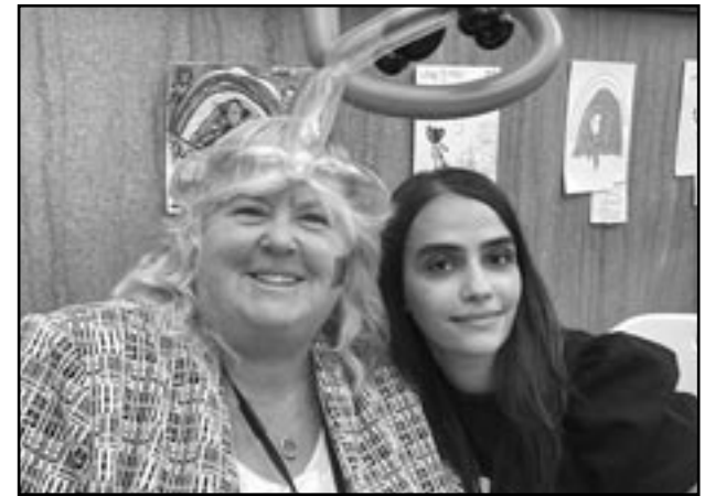
(above) Festivities included a roaming balloon artist; personalized cupcakes; and ice cream, face painting, and friendship-bracelet making stations.