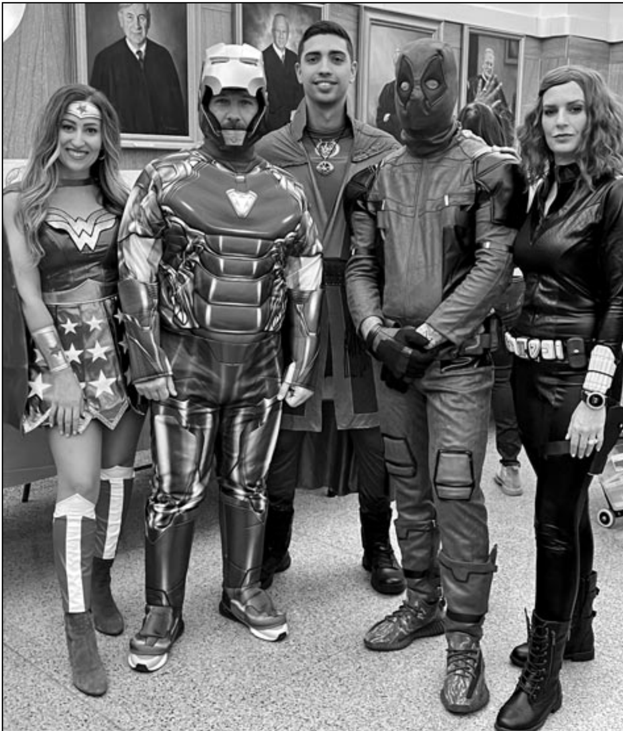
(above) Sheriff's officers dressed as superheroes, and also maned a Batmobile outside