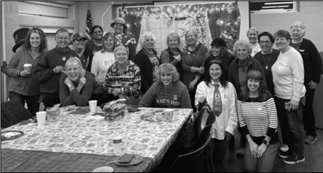
(above) The adult Cookie Exchange held at the Library in December was delicious fun!

ADULT PROGRAMS ***DIGITAL LITERACY TUTORING FRIDAYS STARTING 01/05 3:30PM Improve your computer skills and confidence with Assia. Registration required, as only 2 spots are available each week. ESL TUESDAYS 2:00PM Sign up for our English language learning class. KNITTING CLUB WEDNESDAYS 1:00 - 3:00 PM Knit and crochet winter hats and scarves to donate to charities. QUILTING CLUB 2nd + 4th THURSDAYS 1:00 - 3:00 PM Try out new quilting patterns with friends. ***ADULT BAD CRAFT NIGHT MONDAY 01/08 6:00PM Bring your leftover holiday wrapping scraps to make a "bad art" mosaic display for the library. Feel free to also bring charcuterie board snacks to enjoy while Maria reviews a bad-craft book. ***KNOW YOUR INSURANCE WORKSHOP MONDAY 01/22 11:00AM Learn about who to call and what to ask relating to Medicare, Humana, and financial planning with Natalia Ojeda (licensed insurance agent). ***CAFFEINE AND CHAPTERS ADULT BOOK CLUB THURSDAY 01/25 6:00PM Explore The Uncommon Reader by Alan Bennett over a cup of coffee with Lisa! TECH HELP Mon-Fri 10-5 Available in Spanish or English. Appointments available, walk-ins welcome. Notary Services Mondays, Wednesdays, Thursdays 10:00am-2:00pm; Tuesdays: 1:00pm-8:00pm lease call before arriving to ensure notary is available! Fax, Copy, Print, & Scan Services: Available during library hours. Free WIFI