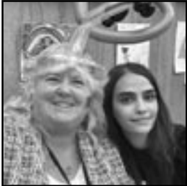
(above, right) Event included a balloon artist; cupcakes; ice cream, face painting, and bracelets.