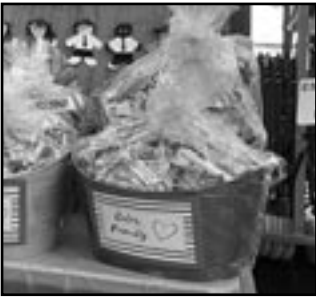
(left) Each family received a basket made possible by CASA of Passaic and Union Counties & the David Brearley Middle High School Bears That Care Program.