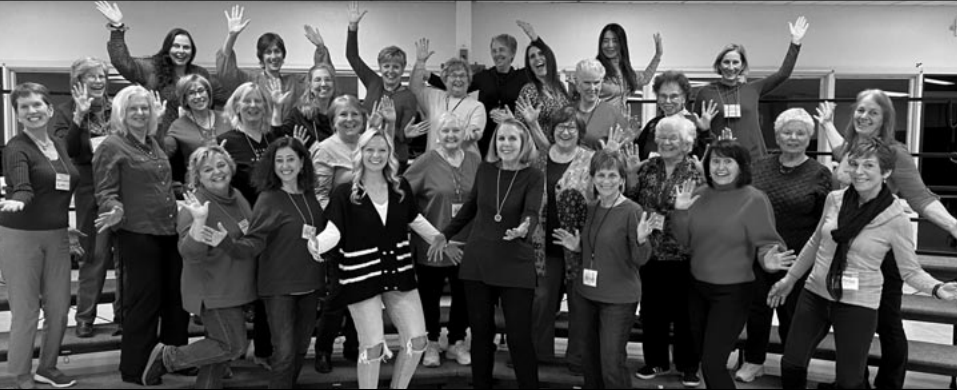
(above) The Hickory Tree Chorus invites the public to sing with them at an Open House, on January 10 and 17, from 6:45 to 9:30 p.m.

Find more information at hickorytreechorus.org .