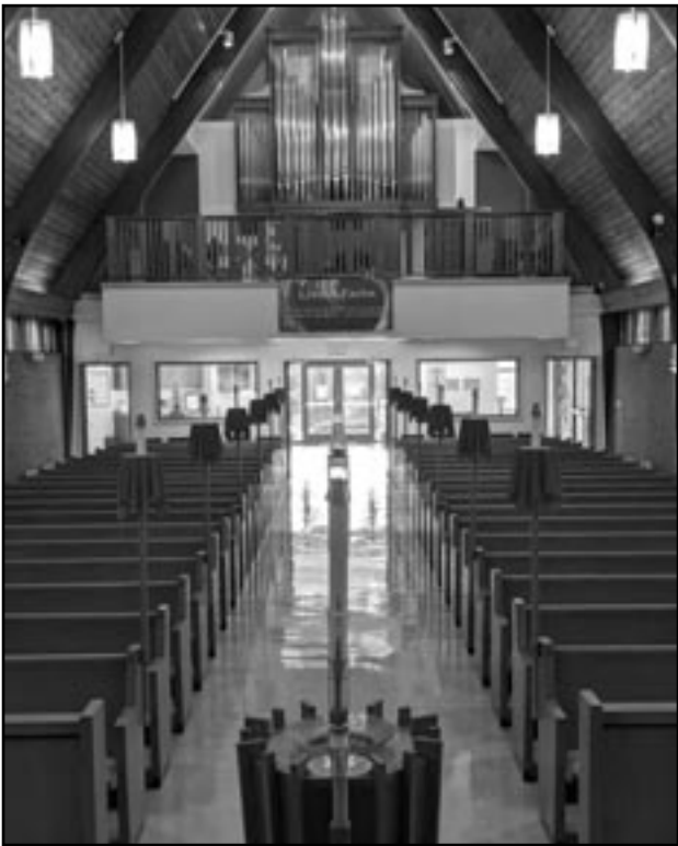
(above) The pipe organ and choir loft at Faith Lutheran Church

Join us for free this festive event! Faith Lutheran Church is located at 524 South Street, New Providence, NJ.