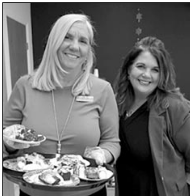
(above) The Senior Center of the Chathams hosted Holiday Parties on two days – November 30th and December 7th. Lunch was served, including deserts and mocktails.