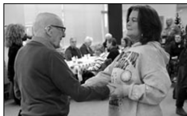
(above) Dancing in your seats or on the dance floor