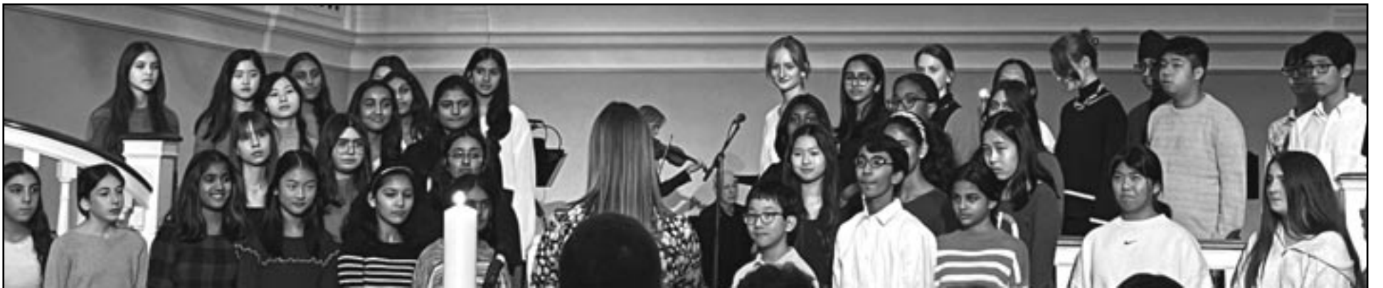
(above) 8th Grade Choir