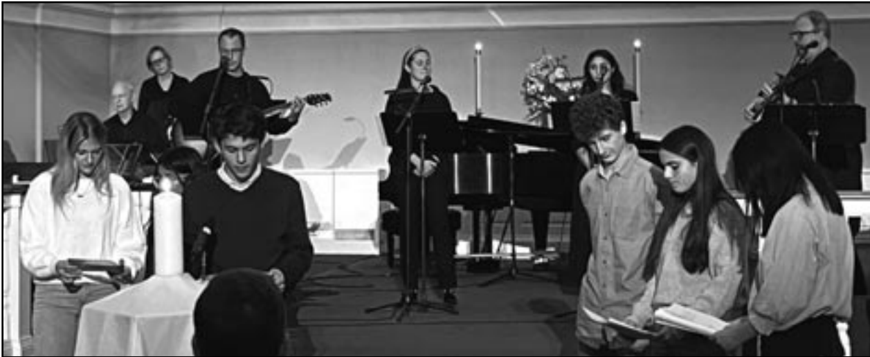
(above) Prayer of St. Francis of Assisi