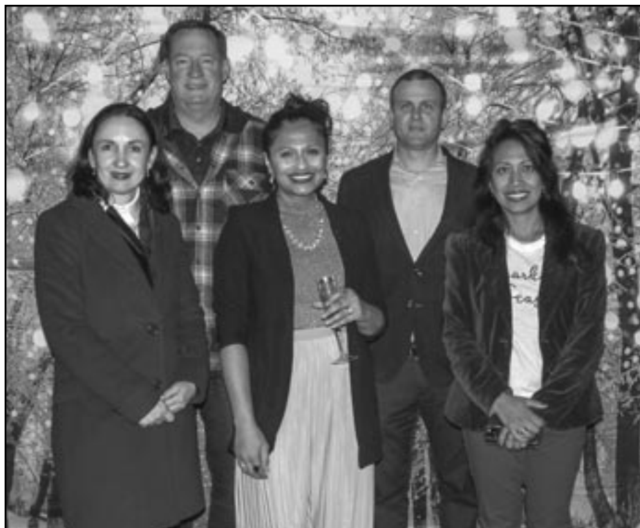
(above) Members of the Millburn-Short Hills Chamber of Commerce and guests gathered in the Art Alley (located on Millburn Ave.) for a family-friendly networking mixer on Sunday, Dec. 4th, 2023.

On behalf of the Millburn Short Hills Chamber of Commerce, I extend my heartfelt gratitude to our members, Millburn Township, and our gracious sponsors - The Hilton Short Hills, The Mall at Short Hills, Papermill Playhouse, Stone Mountain Properties, and Cooperman Barnabas RJW Health System. Their support has been invaluable. Many sponsors also have members who serve on the board of directors, volunteering their time to ensure the Millburn Short Hills Chamber of Commerce continues to make meaningful contributions to the Millburn Short Hills and the business community.