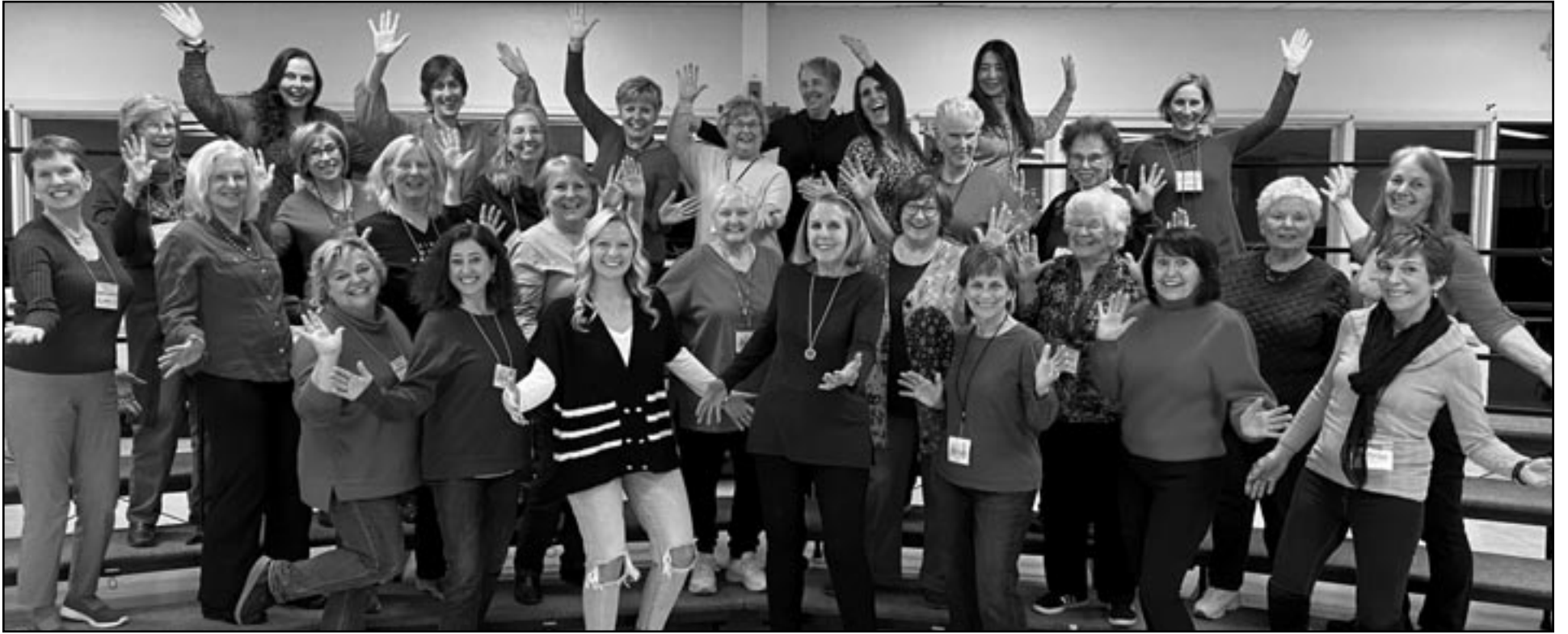
(above) The Hickory Tree Chorus invites the public to sing with them at an Open House, on January 10 and 17, from 6:45 to 9:30 p.m.

Find more information at hickorytreechorus.org .