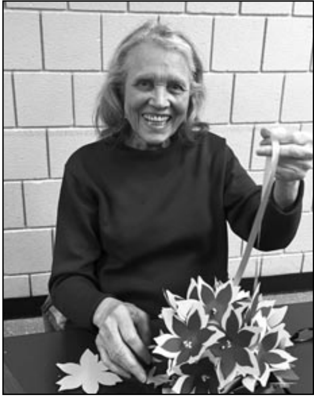
(above) Crafters were getting into the holiday spirit during a recently #creativeaging class. Missed the fun? Join us for collage with @oneriverschool on January 24. Register on our website at millburnlibrary.org/events .

Join us for our 5th Annual Reading Challenge. Our goal is to read 2,204 books this winter! Log the books you read during the month of January at beanstack.millburn.org to win prizes. For all ages! Sponsored by the Friends of the Millburn Library.