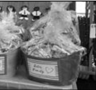
(left) Each family received a basket made possible by CASA of Passaic and Union Counties & the David Brearley Middle High School Bears That Care Program.