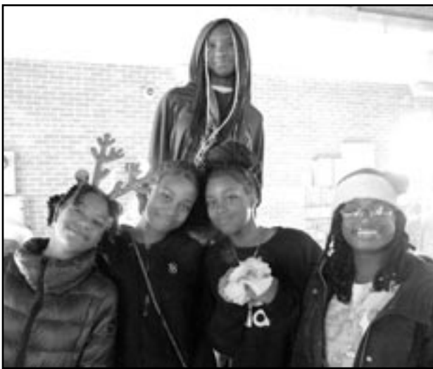
(above) Linden High School and Soehl Middle School students celebrated with left Santa Claus, hot pretzels and hot chocolate.