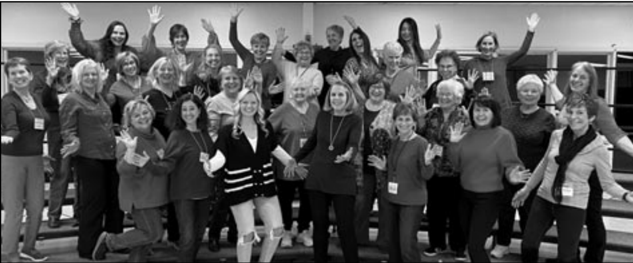
(above) The Hickory Tree Chorus invites the public to sing with them at an Open House, on January 10 and 17, from 6:45 to 9:30 p.m.

and orientations to visit us and share our joy of music. by email at info@hickorytreechorus.org . Find more information at hickorytreechorus.org . Please contact the Chorus for the Open House