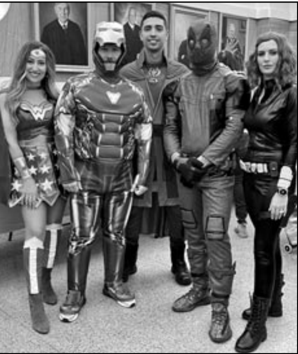
(above) Sheriff's officers dressed as superheroes, and maned a Batmobile outside the courthouse.