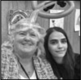
(above, right) Event included a balloon artist; cupcakes; ice cream, face painting, and bracelets.