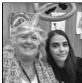
(above, right) Event included a balloon artist; cupcakes; ice cream, face painting, and bracelets.