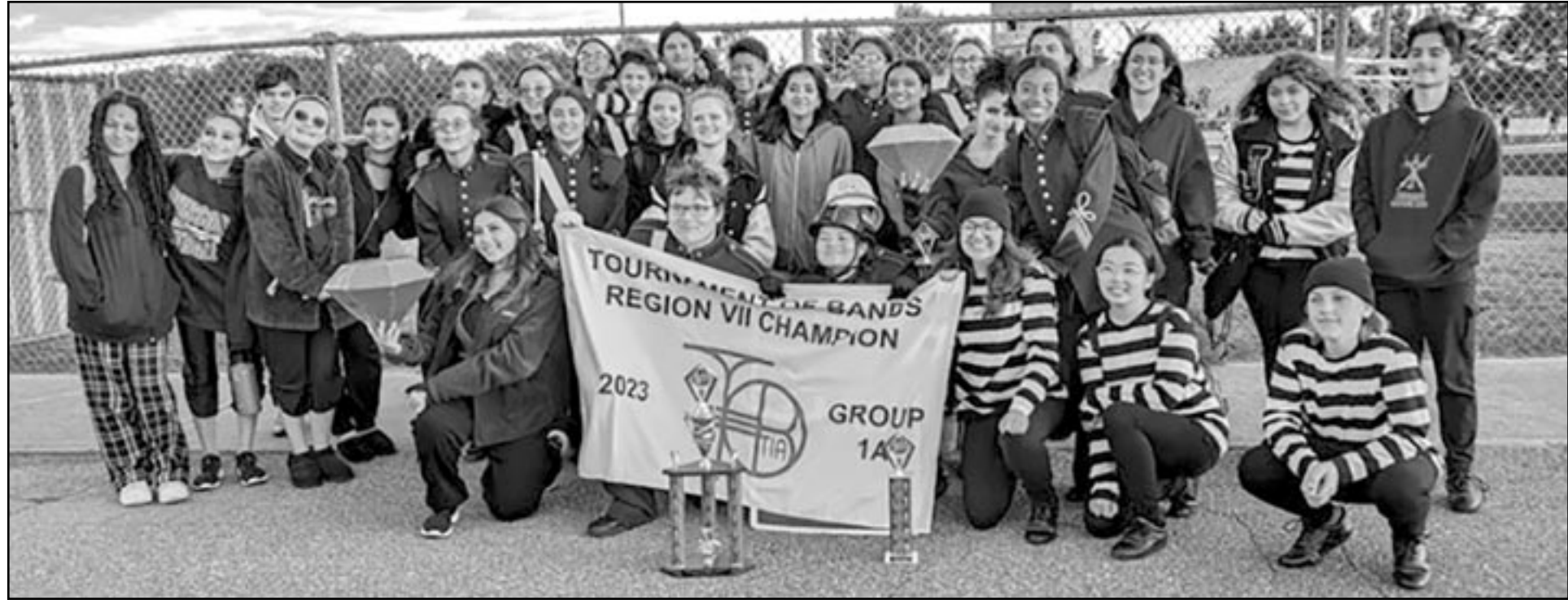
(above) the ALJ High School Crusader Marching Band