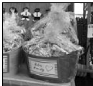
(left) Each family received a basket made possible by CASA of Passaic and Union Counties & the David Brearley Middle High School Bears That Care Program.