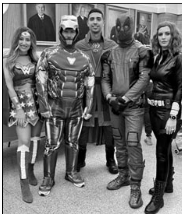
(above) Sheriff's officers dressed as superheroes, and maned a Batmobile outside the courthouse.