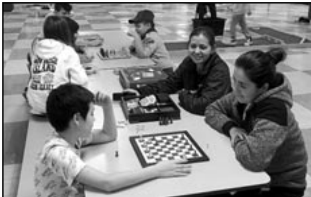
(above) Boy Scout Troop 23 and Cub Scout Pack 23 hosted Webby's Fun Fest in St. Genevieve's Church hall.