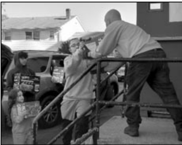
(above) Boy Scout Troop 23 and Cub Scout Pack 23 delivered 4,200 pounds of food donations to four local food pantries.

With so many of our neighbors still in need, this food will help a lot of people. Thank you to everyone who contributed food items, frozen turkeys or cash (which will be converted to grocery gift cards). Your generosity is most appreciated!