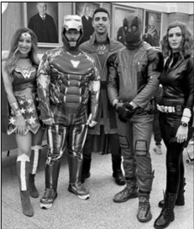
(above) Sheriff's officers dressed as superheroes, and maned a Batmobile outside the courthouse.