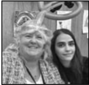
(above, right) Event included a balloon artist; cupcakes; ice cream, face painting, and bracelets.