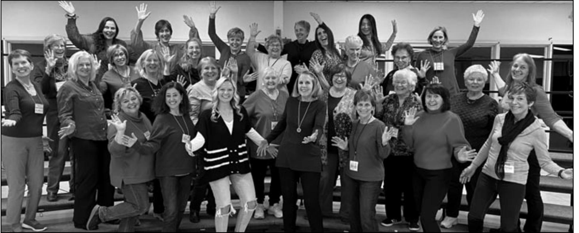
(above) The Hickory Tree Chorus invites the public to sing with them at an Open House, on January 10 and 17, from 6:45 to 9:30 p.m.

Find more information at hickorytreechorus.org .