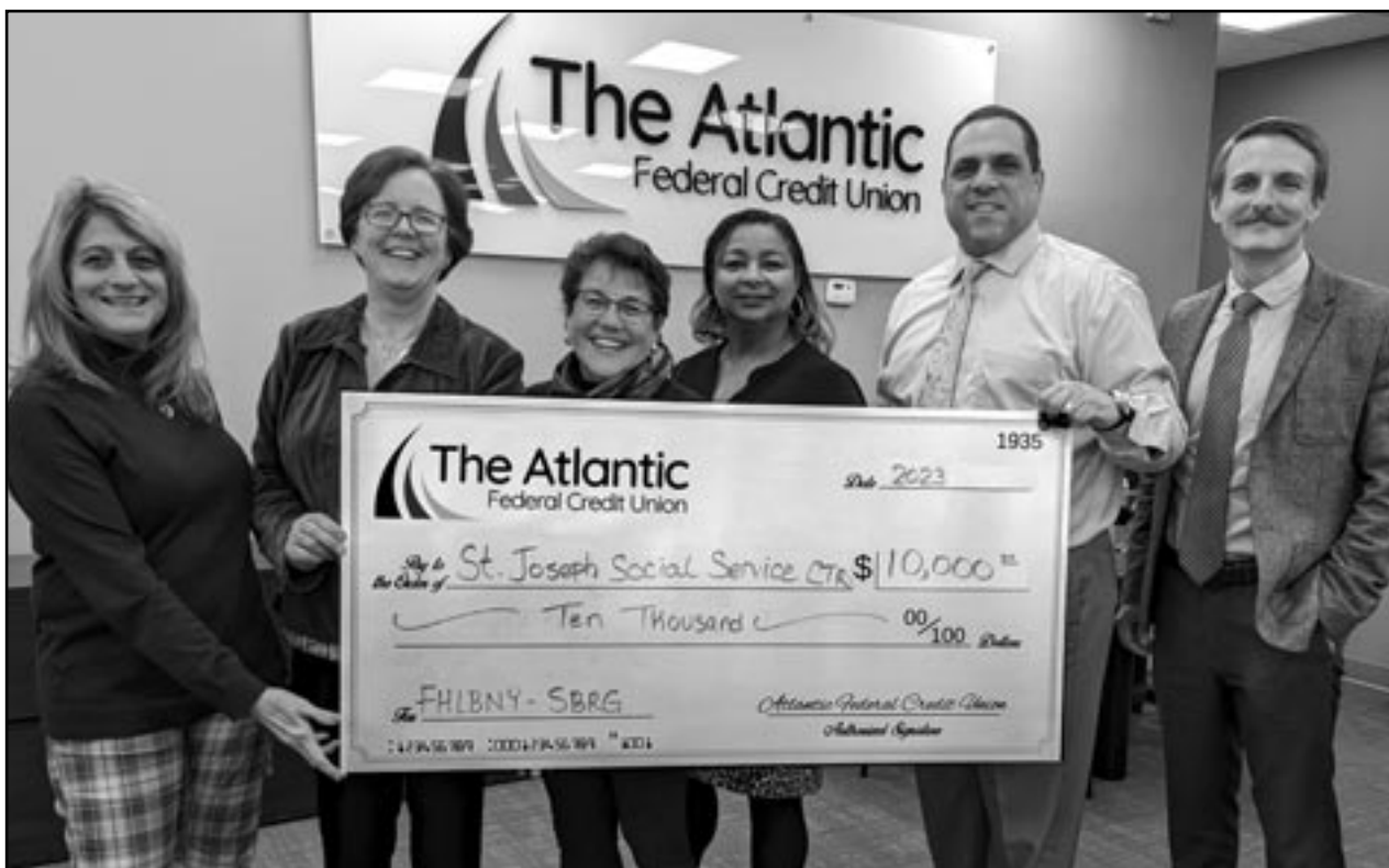
(above) Check Presentation St. Joseph Social Service Center: Since 1983, St. Joseph Social Service Center has served the materially poor and homeless community of greater Elizabeth, New Jersey, by providing basic human needs such as food, clothing and medications, as well as a wide range of services and programs to help them acquire the material goods and social services they need to live with dignity. St. Joseph Social Service Center's range of services include a food pantry, health and wellness programs, mental health counseling, an Adult Learning Center, access to clothing and household items, and more. Learn more at sjeliz.org .