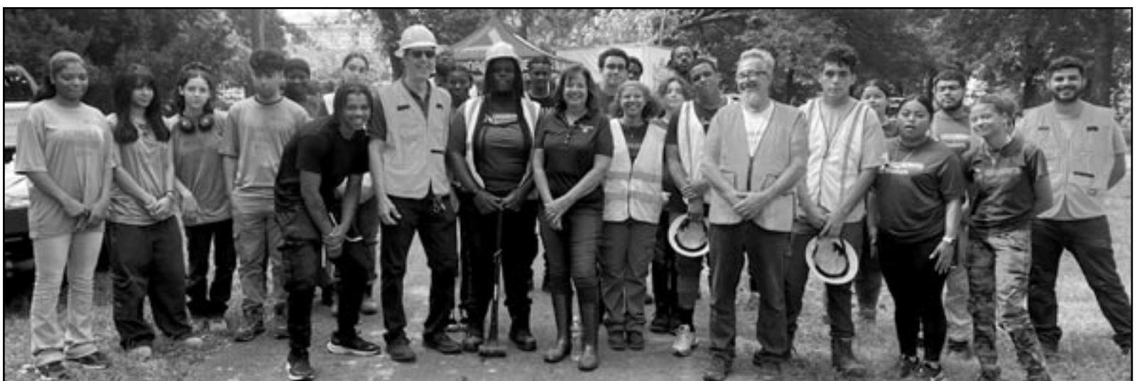
(above) Groundwork Team joined by Phillips 66 team members at Trotters Branch of the Elizabeth River site.

The park was closed for work from July through mid-November and is now open to the public. For more details about this project and more information on Groundwork, visit groundworkelizabeth.org .