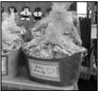
(left) Each family received a basket made possible by CASA of Passaic and Union Counties & the David Brearley Middle High School Bears That Care Program.