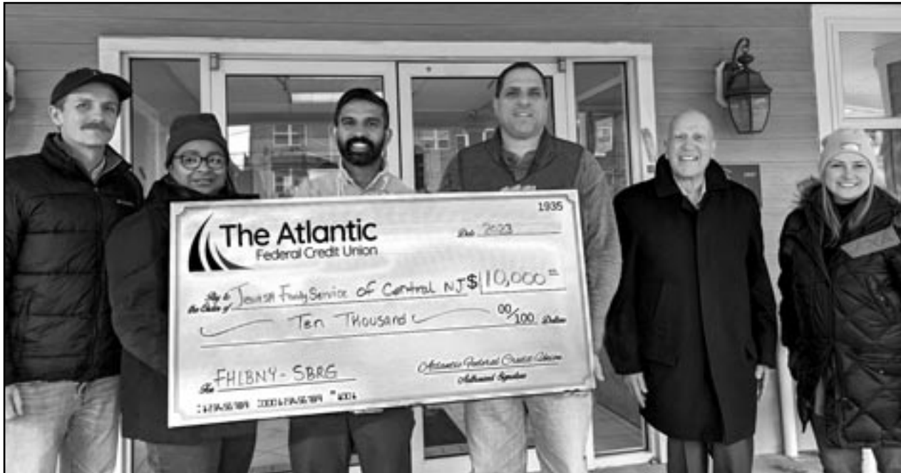
(above) Check Presentation Jewish Family Service of Central New Jersey: The mission of Jewish Family Service of Central NJ, a non-sectarian health and social service agency, is to strengthen family life and encourage personal growth by providing specialized quality services to individuals and families in need in Union County. The Agency is a licensed mental health outpatient agency and a licensed and accredited homecare agency. A diverse staff who speak 11 languages provides a full range of services from mental health counseling, to Kosher Meals On Wheels, to an active Food Pantry and Urban Community Garden. Learn more at jfscentralnj.org .